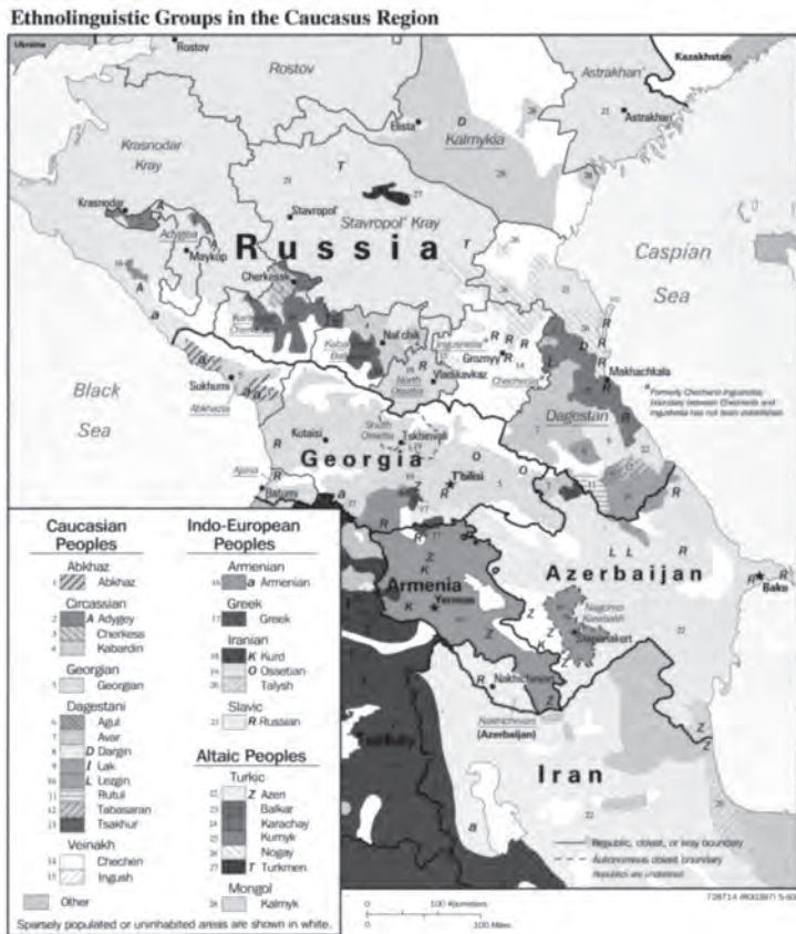
Map 1. North Caucasus Ethnic Divisions. 10

from roughly the 8th to the 12th centuries. Chechens were much later, adopting Islam during the 15th and 16th centuries, while the nations of the Western part of the North Caucasus finally did so 2 centuries later. 9 Meanwhile, their southern neighbors Georgia and Armenia continued to follow the Christian Orthodox tradition, each having its own autocephalous Church. For an illustration of ethnic divisions in North Caucasus, see Map 1.