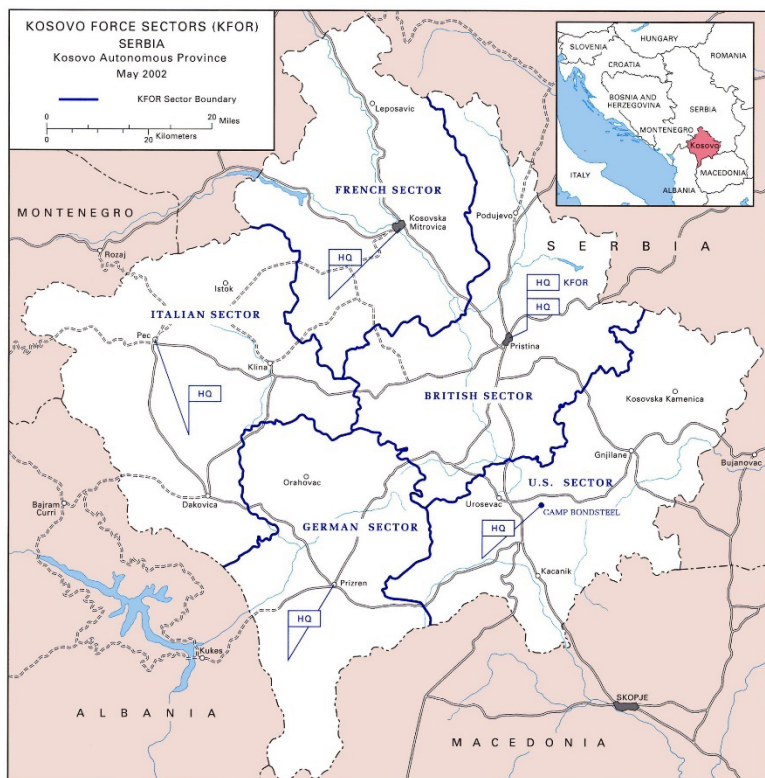
Figure 2: KFOR Brigade Sectors 150

(United States), MNB South (Germany), MNB West (Italy), and MNB North (France), depicted in Figure 2. While 50,000 troops were authorized for KFOR, in 1999, roughly 35,500 were deployed from 17 member states. 149