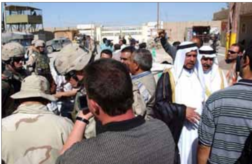
Soldiers, local sheiks and Iraqi media members crowd together during a recent detainee release program held at Camp Hawk, home of the 303rd Iraqi National Guard Battalion. The 91st Engineer Battalion, 2nd Brigade Combat Team, 1st Cavalry Division provided security measures that facilitated the orderly release of the former prisoners.