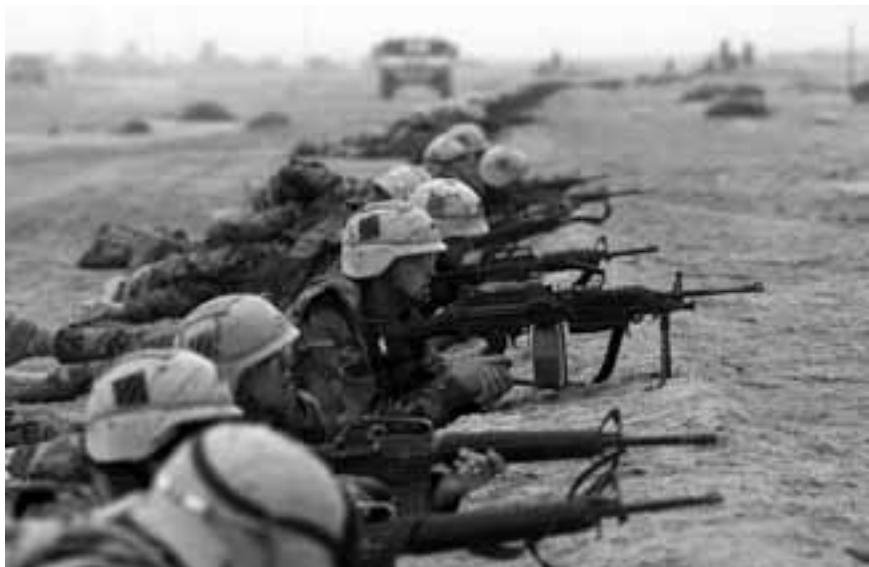
3rd Infantry Division in defensive firing positions, Southern Iraq, 24 March 2003.