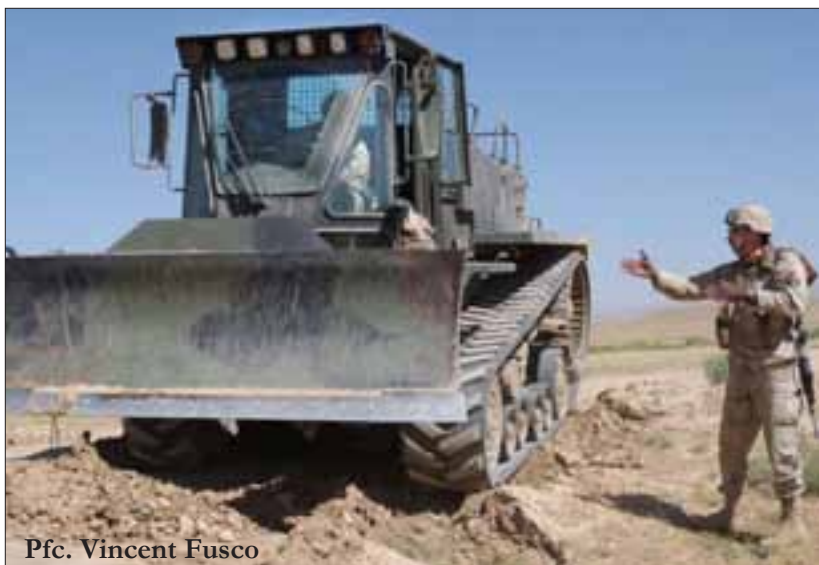
Pfc. Vincent Fusco