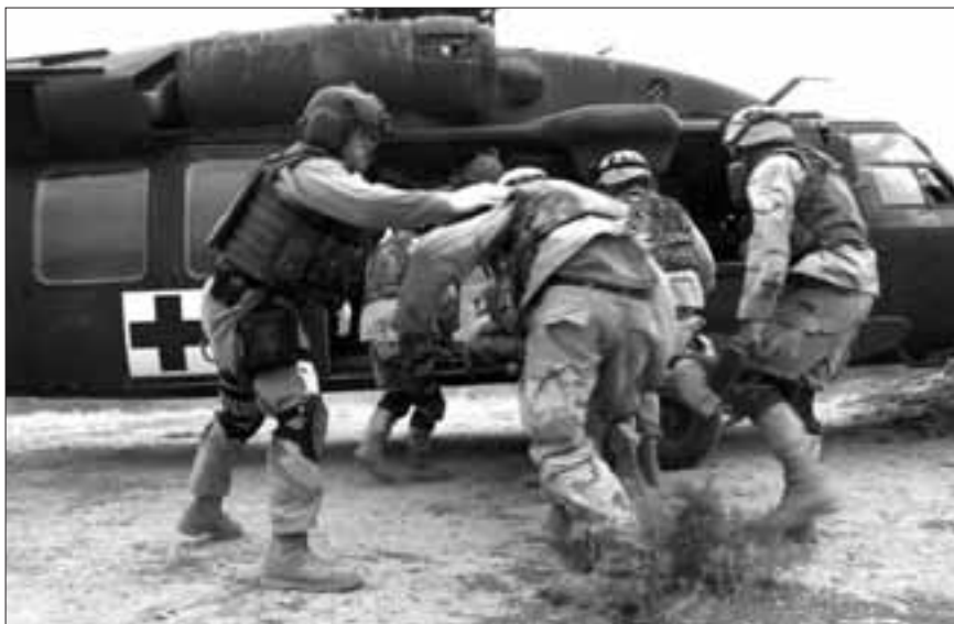
Soldiers of the 68 th Medical Company assist a patient onto a helicopter.