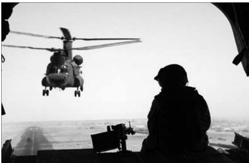
View from door gunner's position of CH-47 Chinook helicopter.

On 10 October 2001, the 5 th Special Forces Group deployed to a staging area not far from Afghanistan. There they united with other Army Special Operations Forces units to create "Task Force Dagger." The units which worked with the