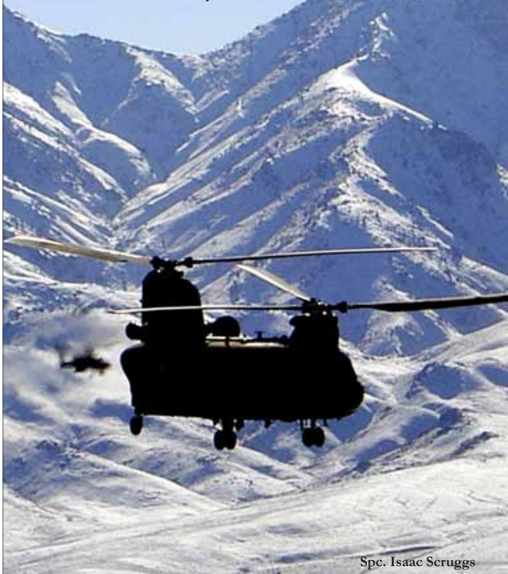
Spc. Isaac Scruggs

A CH-47 Chinook helicopter flies through a mountain range in Afghanistan, carrying cargo and personnel to a Coalition facility. Chinooks, dubbed the workhorses of Army Aviation, proved their worth in Afghanistan often performing tasks meant for Blackhawks, which were ineffective at higher elevations.