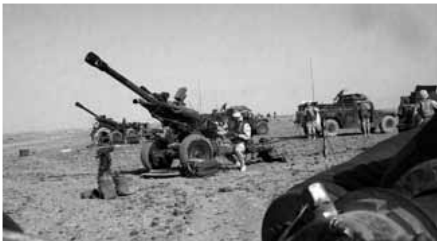
M119A1 105 Lightweight Towed Howitzers

rocket-assisted projectiles and Charge 8). Every round fired supported an essential fire support task and took the form of demonstration fires, precision registration fires, counter rocket and counter mortar fires, or danger-close support for troops in contact.