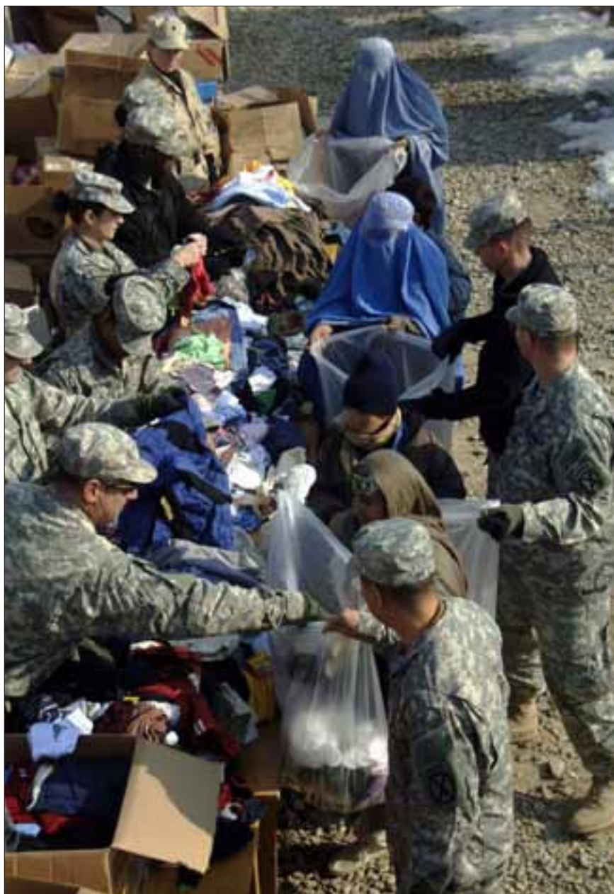
February 09, 2007 | Soldiers with the 10th Mountain Division's 14th Combat Support Hospital distribute clothing and other items to Afghan villagers at a staging area near Bagram Airfield, Afghanistan, during a medical civil action program Jan. 15.