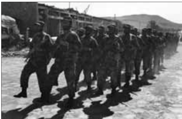
1 st Battalion, Afghan National Army

To help establish a working relationship with the militia force based on mutual trust and respect, some ground rules were initially established. First, ODA members were not allowed to use derogatory terms when referring to the Afghan Militia Forces. Using profanity or shouting at the militiamen could get you a one-way ticket back to Bagram. Most members of the militiamen did not speak English, but they did understand when you were talking about them in a derogatory manner. The rule was that you manhandled a militiaman only when it was necessary. Second, ODA members would pay the correct amount for services and goods. Not paying enough is the same as robbery and leads to ill will among the civilian population. Also, it establishes a dangerous example for your indigenous forces. The guns and troops present an intimidating image to local people, keep this in mind. No ODA member is to accept gifts. Accepting a valuable gift only sets up the expectation that you now owe the gift giver a favor. If you maintain the moral high ground when dealing with all aspects of daily