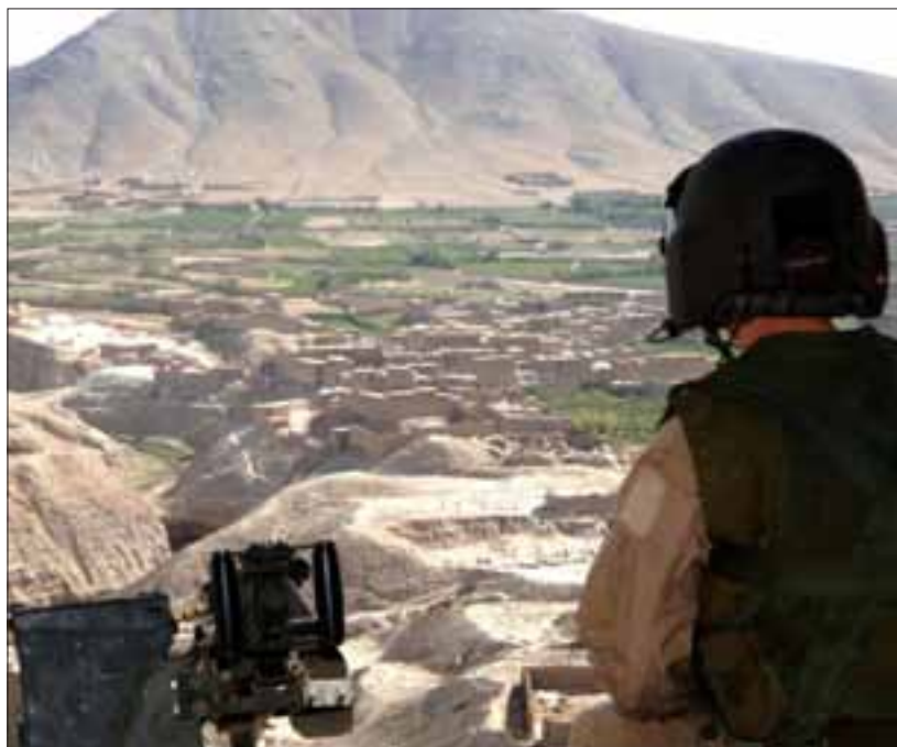
by Spc. Joshua Balog, October 5, 2005 | A Soldier from Task Force Sabre performs rear security aboard a CH-47 Chinook helicopter near Kabul, Afghanistan.