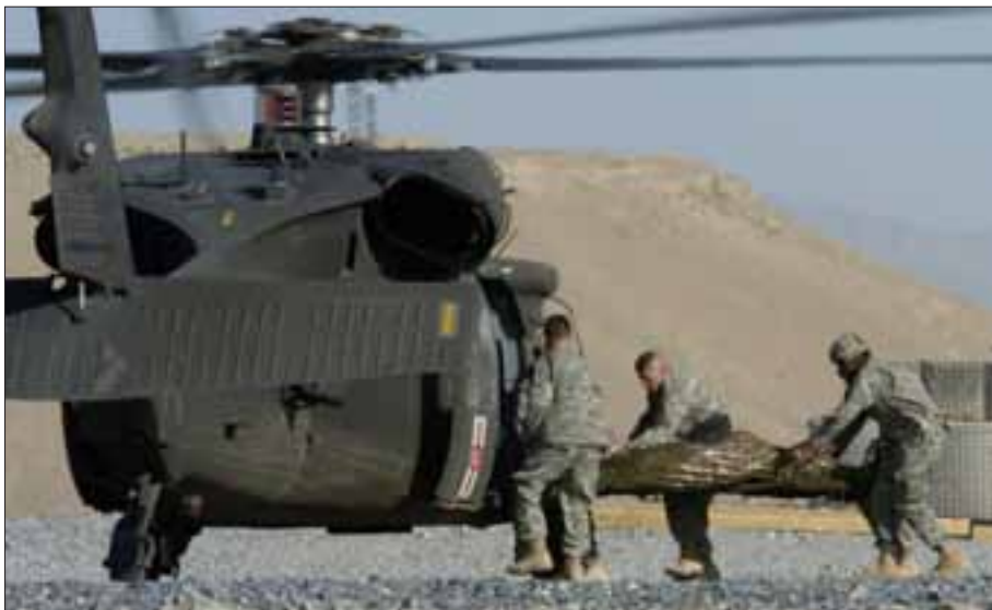
by SrA Brian Ferguson, September 1, 2006 | Soldiers load a casualty aboard a UH-60 air ambulance during a medevac mission near Qalat.