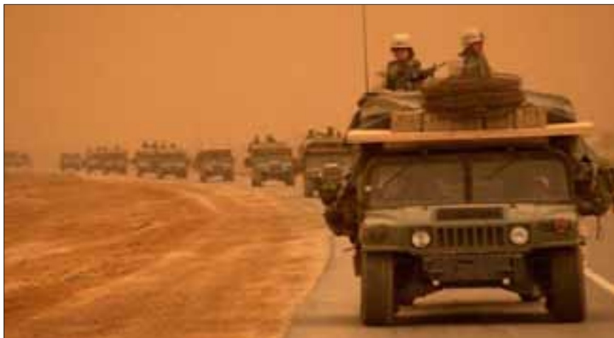
by Spc. Jason Baker, May 2, 2003 | Battery B, 2nd Bn., 319th Airborne Field Artillery Regiment, convoy north along Highway 8 in Iraq. The artillerymen position to support the 82nd's 2nd Brigade Combat Team during its operations to secure the main supply route leading to Baghdad.