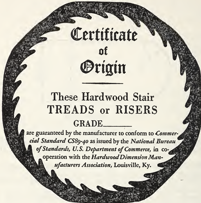
FIGURE 2.—Facsimile of certificate of the Hardwood Dimension Manufacturers Association.

The Hardwood Dimension Manufacturers Association, in concert with producer members, plans to issue a certificate of grade as shown in figure 2, with invoices or with each package.