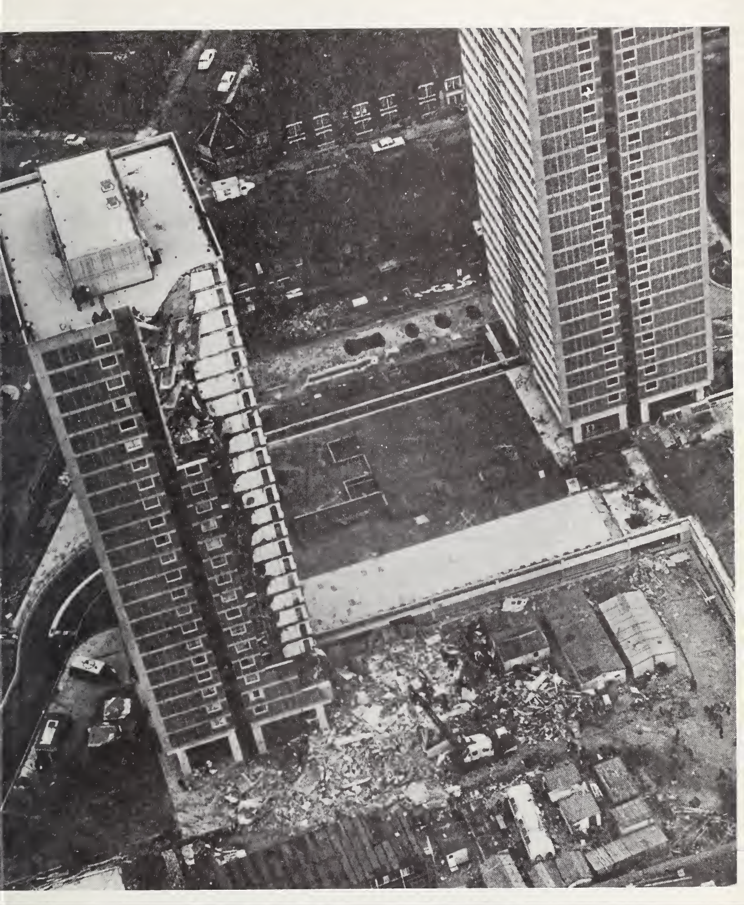
Figure 1 Ronan Point Apartment Building after the collapse, with a second identical building in the background. Reproduced from [1].