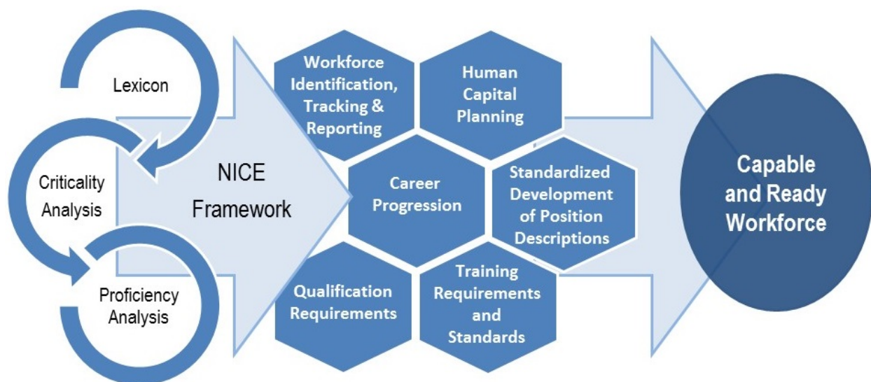
Figure 2 - Building Blocks for a Capable and Ready Cybersecurity Workforce

Figure 2 illustrates how the NICE Framework is a central reference to help employers build a capable and ready cybersecurity workforce.