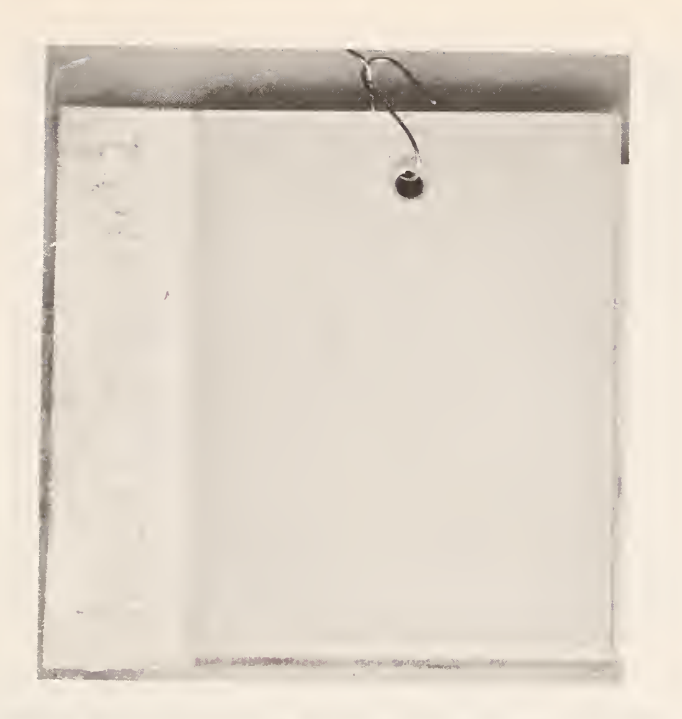
Figure 2. The back surface of a test specimen for the fungus resistance test. The right portion of the specimen shows the glass substrate to which the plastic wallcovering material was ahered. The left side of the test specimen, where the code number is written, is the area where the effect of fungi was evaluated on the backing material alone.

Of the thirteen materials tested in triplicate, only three had no fungus growth on the front surface of any of the test specimens. Figures 3 and 4 illustrate examples of fungal growth on the wallcovering surface. A material having no fungal growth is illustrated in Figure 1. Two materials also had no growth on the exposed backing of the material, see Figure 2. Fungal growth on the backing material is illustrated in Figures 5 and 6. The adhesives also promoted the fungal growth as only a few of the test specimens were free of fungi around the edges at the interface between the material and the glass. An example of fungal growth around the edges can be seen in Figure 7. Nine of the materials developed fungus growth in the adhesive under the glass. This is illustrated in Figure 6.