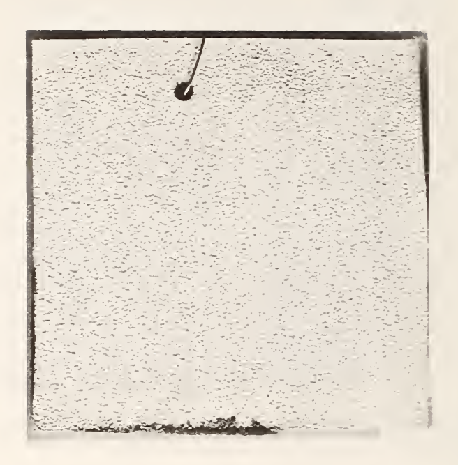
Figure 7. A test specimen exhibiting fungal growth in the adhesive around the edges.