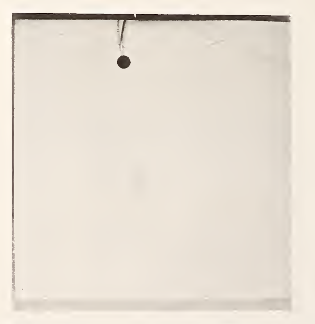
Figure 1. The front surface of a test specimen for the fungus resistance test.

The specimen holders (Figures 1 & 2) were glass, and the wallcoverings were adhered to the glass with the manufacturers' recommended adhesives. The 25 mm by 100 mm (1 inch by 4 inches) overlap of the wallcoverings was designed to measure any effect of the fungi on the backing material alone as no adhesive was applied to this area. Thus the growth of fungi on the surface of the wallcovering, the backing, and the adhesive could be readily determined visually.