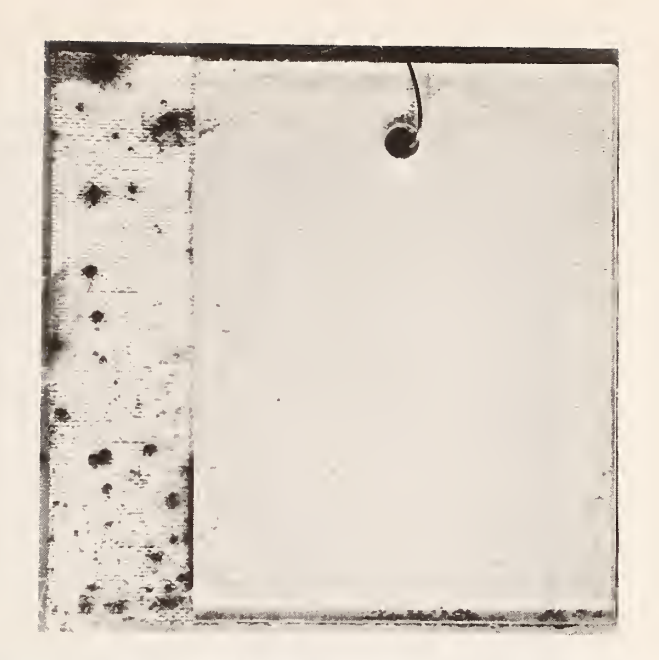
Figure 5. The backing material at the left has developed fungal growth during the fungus resistance test.