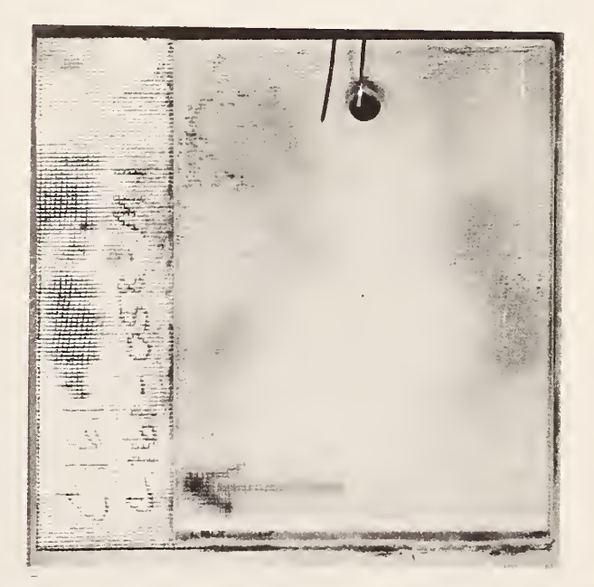
Figure 6. An example of fungal growth on the exposed backing material (left side) and in the adhesive between the wallcovering and the glass.