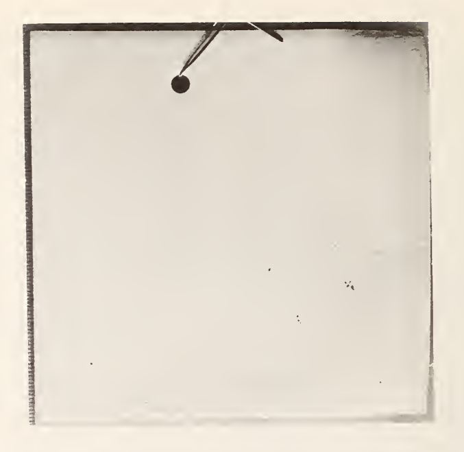
Figure 3. An example of fungal growth on a wallcovering material.