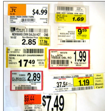
Figure 1. Examples of Unit Pricing Labels

These shortcomings, if not addressed, will significantly reduce consumers' confidence and use of the system, which in turn reduces the benefits obtained by consumers, retailers, and the economy.