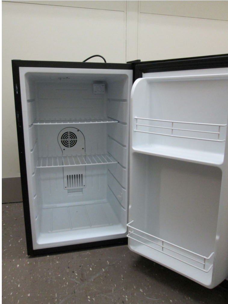
Figure 5.1 Thermoelectric Compact Refrigerator

The final unit examined is a 71 liter (2.5 cubic foot) compact refrigerator, shown in Figure 5.1. The unit has a single compartment which included two moveable wire racks. It was outfitted with three thermocouples for testing.