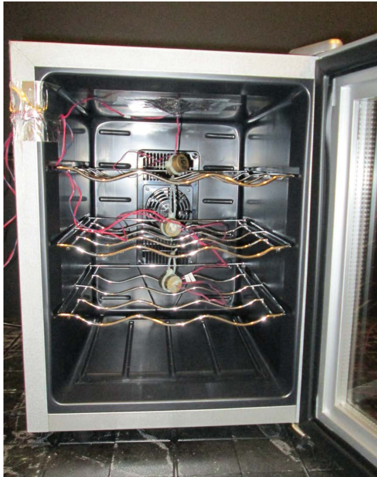
Figure 3.1 Thermoelectric 12-Bottle Wine Chiller

The first unit studied was a small 33 liter (1.2 cubic foot) thermoelectric wine chiller designed to store 12 bottles of wine, shown in Figure 3.1. The cooled compartment consists of three-bottle storage at the bottom of the cabinet and three moveable metal racks designed to store three bottles of wine each. The temperature in the cabinet is controlled by an externally accessible thermostat controlling the thermoelectric module and air is circulated in the compartment by a small fan located at the rear.