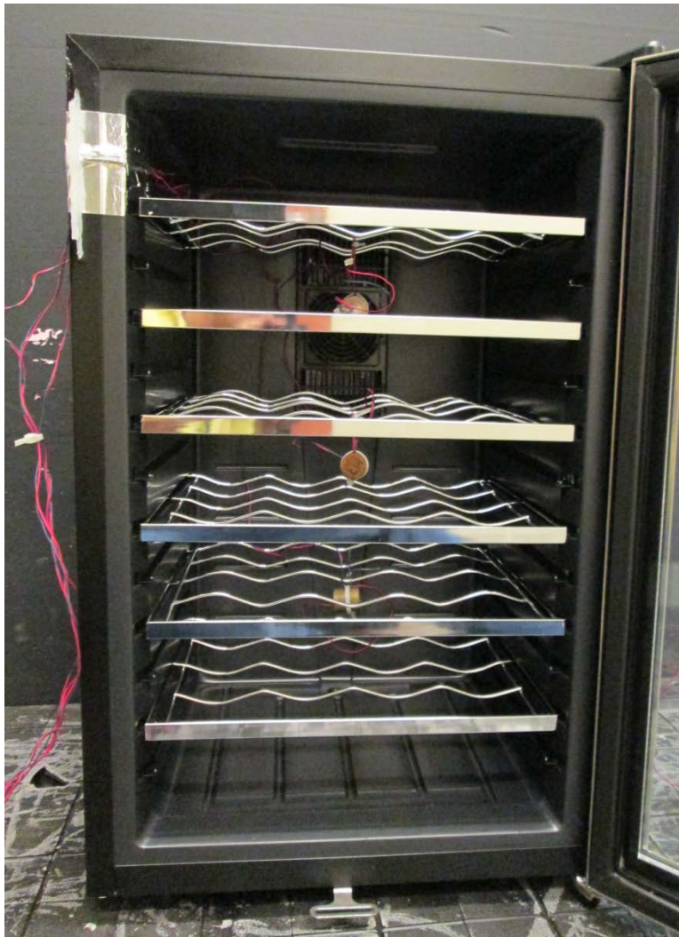
Figure 4.1 Thermoelectric 28-Bottle Wine Chiller

The second unit studied is a 65 liter (2.3 cubic foot) thermoelectric wine chiller designed to store 28 bottles of wine, shown in Figure 4.1. The cooled compartment consists of four-bottle storage at the bottom of the cabinet and six metal racks designed to store four bottles of wine each. The temperature in the cabinet is controlled by variable power input to the thermoelectric module and air is circulated in the compartment by a small fan located at the rear.