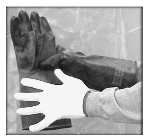
Samples of protective gloves.

OLES issued the protective glove test protocol as NIJ Test Protocol 99-114, "Test Protocol for Comparative Evaluation of Protective Gloves for Law Enforcement and Correction Applications", June 1999. OLES also helped National Law Enforcement and Corrections Technology Center (NLECTC) in selecting qualified glove testing labs through a competitive process. This resulted