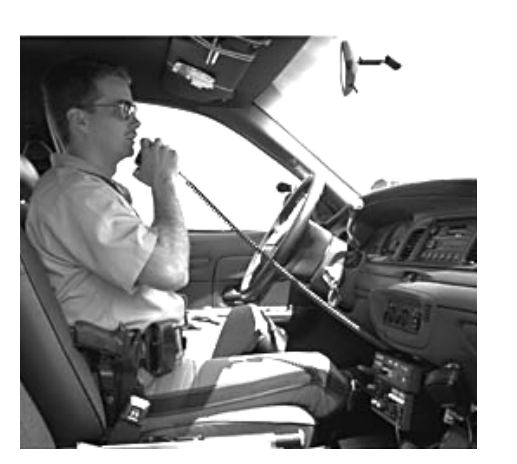
The ability of an officer to communicate with other local agencies and emergency responders is critical to efficient and safe operations.

This project is geared toward solving public safety interoperability and information sharing problems by developing and adopting NIJ standards for voice, data, image, and video information transfers.