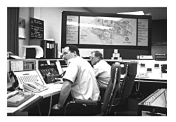
Effective communication is a critical aspect of both law enforcement and corrections operations. Dispatch is the nerve center of the agency.

With the explosion of telecommunications and information technologies has come a disturbing trend – a lack of interoperability among systems. This is demonstrated most dramatically in the public safety community, as police and other agencies (such as fire departments, emergency medical services, etc.) fail to communicate with each other during multi-jurisdictional events (such as the Columbine High School tragedy). Even when local or regional calamities do not occur, however, daily interoperability problems continue to plague public safety agencies nationwide.