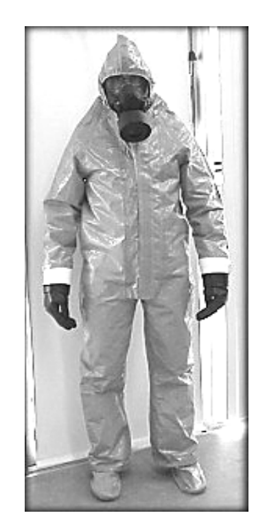
A chemical/biological protective suit

The goal of this subproject is to further develop and demonstrate selectively permeable fabric systems that have been proven to provide excellent protection against CB warfare agents, and to provide protection against toxic industrial materials (TIMs) in liquid, vapor, and aerosol forms. Ultimately, a Level A protective ensemble will be produced for protection against not only CB warfare agents but also protection from exposure and for the safe handling of TIMs.