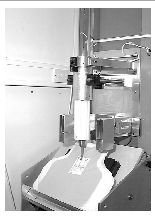
Stab test apparatus used to support development of NIJ body armor standard for stab resistance.

OLES staff will monitor testing to identify any potential problem areas, and work to resolve those. This might include conducting independent testing at the OLES laboratory, consulting with others in the field, or issuing clarifying instructions to address the deficiency.