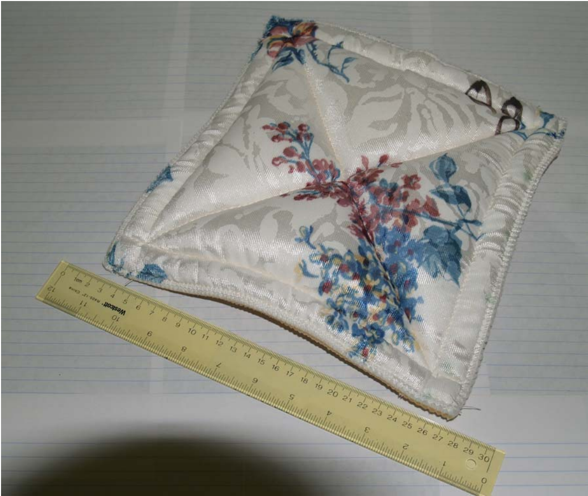
Figure 3. Example of a quilt layer sample showing the edge seams and the central X seams. The cigarette is placed into one leg of the X.