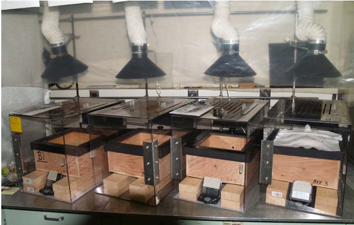
Figure 6. Apparatus for four simultaneous bench-scale cigarette ignition tests conducted in one overhead fume hood.