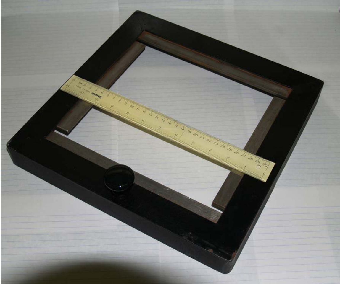
Figure 2. Steel frame used to hold a quilt sample firmly on top of the foam fill in the bench-scale box test. The knob facilitates placement of the frame on top of the test box when it is inside the plastic enclosure shown in Fig. 4.