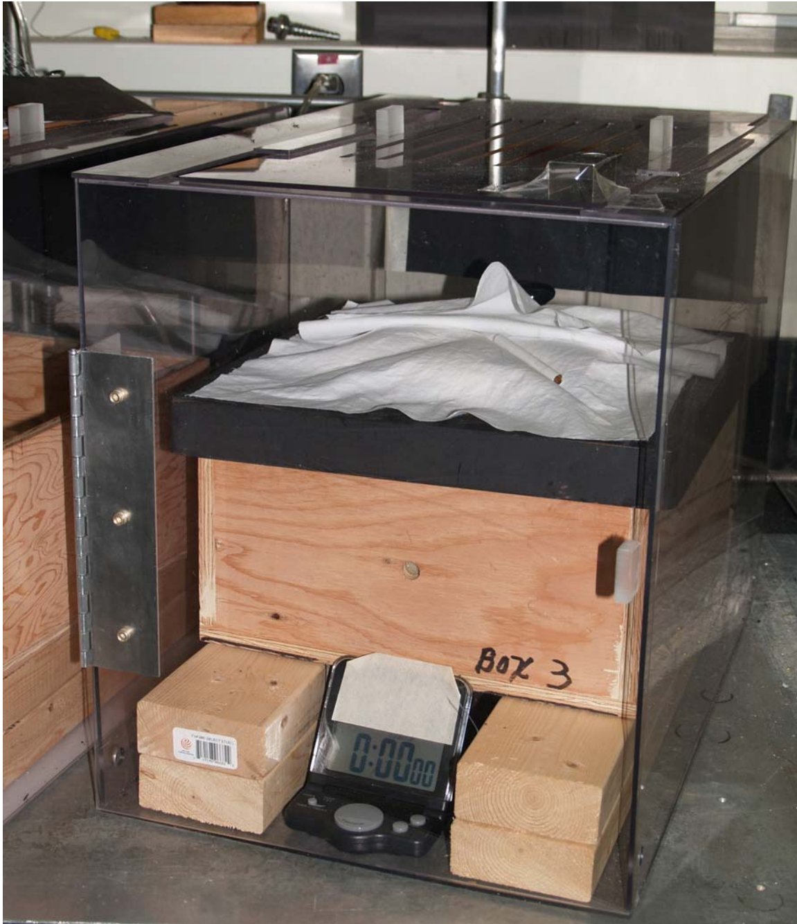
Figure 4. Bench-scale cigarette test assembly contained inside clear plastic box for draft control. Note slotted section of top of plastic box that is slid forward to permit IR thermometer readings.