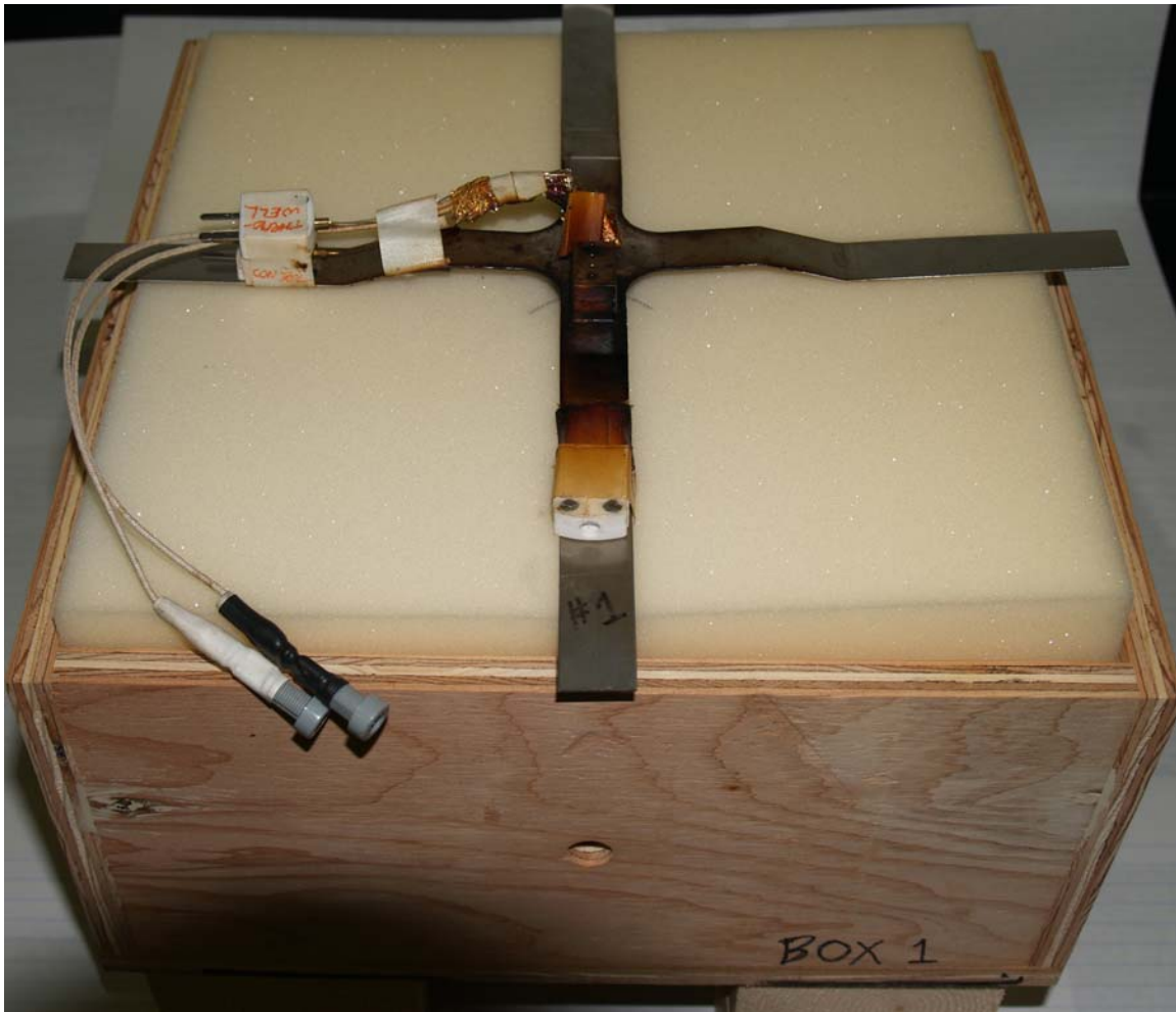
Figure A-2. Smolder test device inserted into foam.