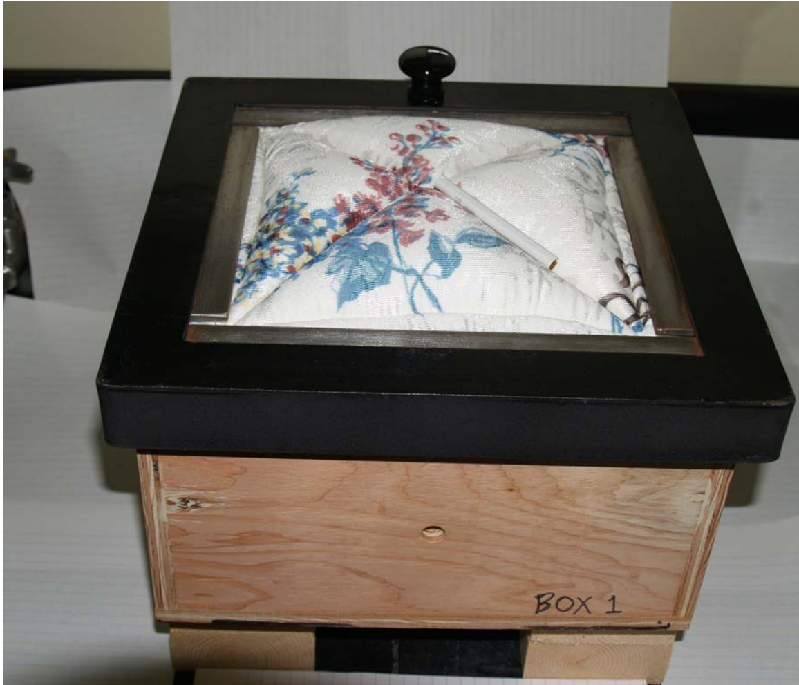
Figure 1. Overview of the bench-scale box test assembly showing the cigarette placement. The 30 ½ cm by 30 ½ cm (12 in by 12 in) laundered, cotton bedsheet sections, used in most of the tests reported here (over and under the cigarette), are not shown.