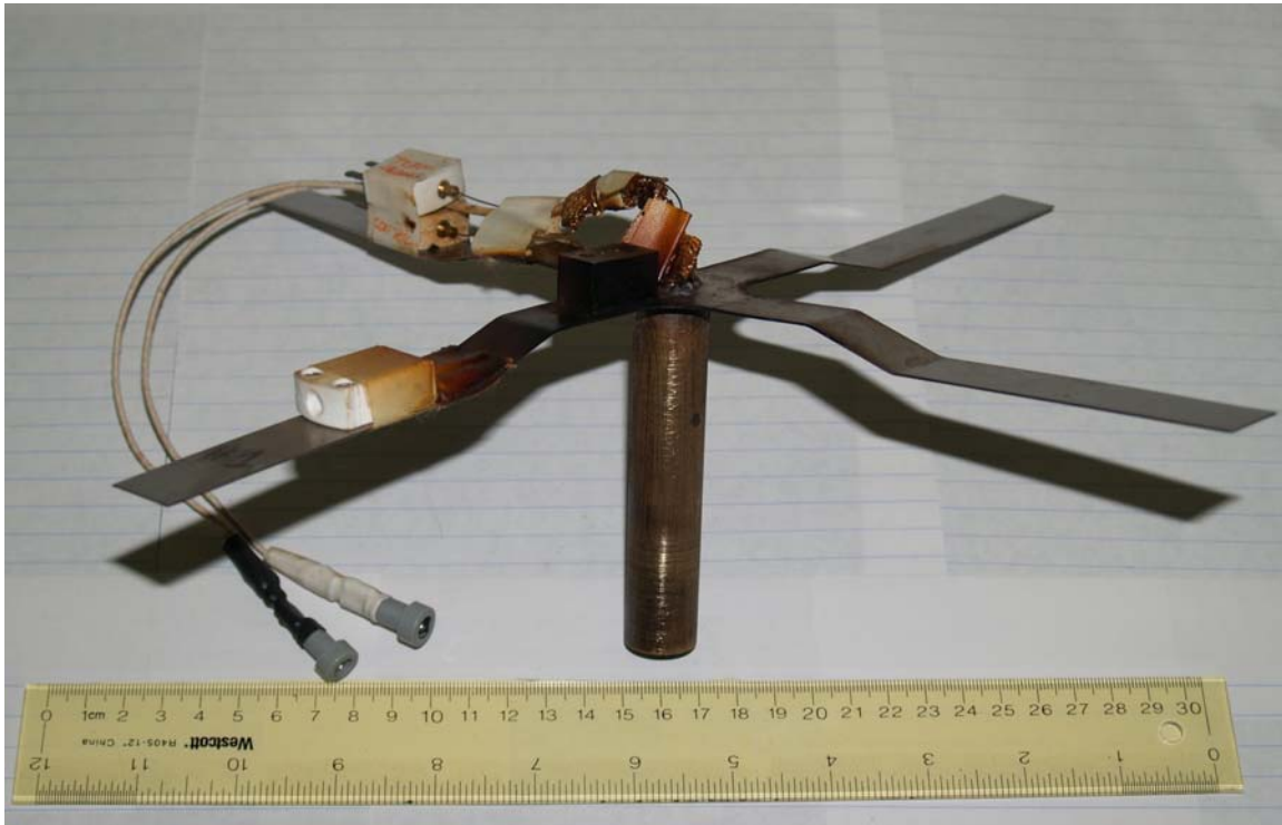
Figure A-1. Smolder test device showing cylindrical jacket containing heater and arms that support the unit on top of the foam.