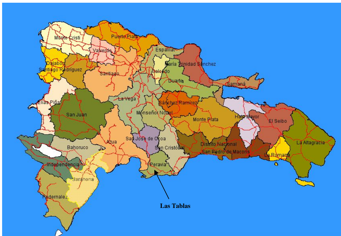
Figure 1. Map of Dominican Republic. The Food Security Pilot Survey was conducted in Las Tablas.

study focused on populations that are prone to frequent and severe food insecurity, we used a 30 day reference period and modified questions in the module accordingly. This included changing questions 8a, 12a and 14a, which ask how often conditions occurred, to accommodate the 30 day reference period. We also omitted the first level-preliminary screener questions since a large majority of the target population was expected to be food-insecure.