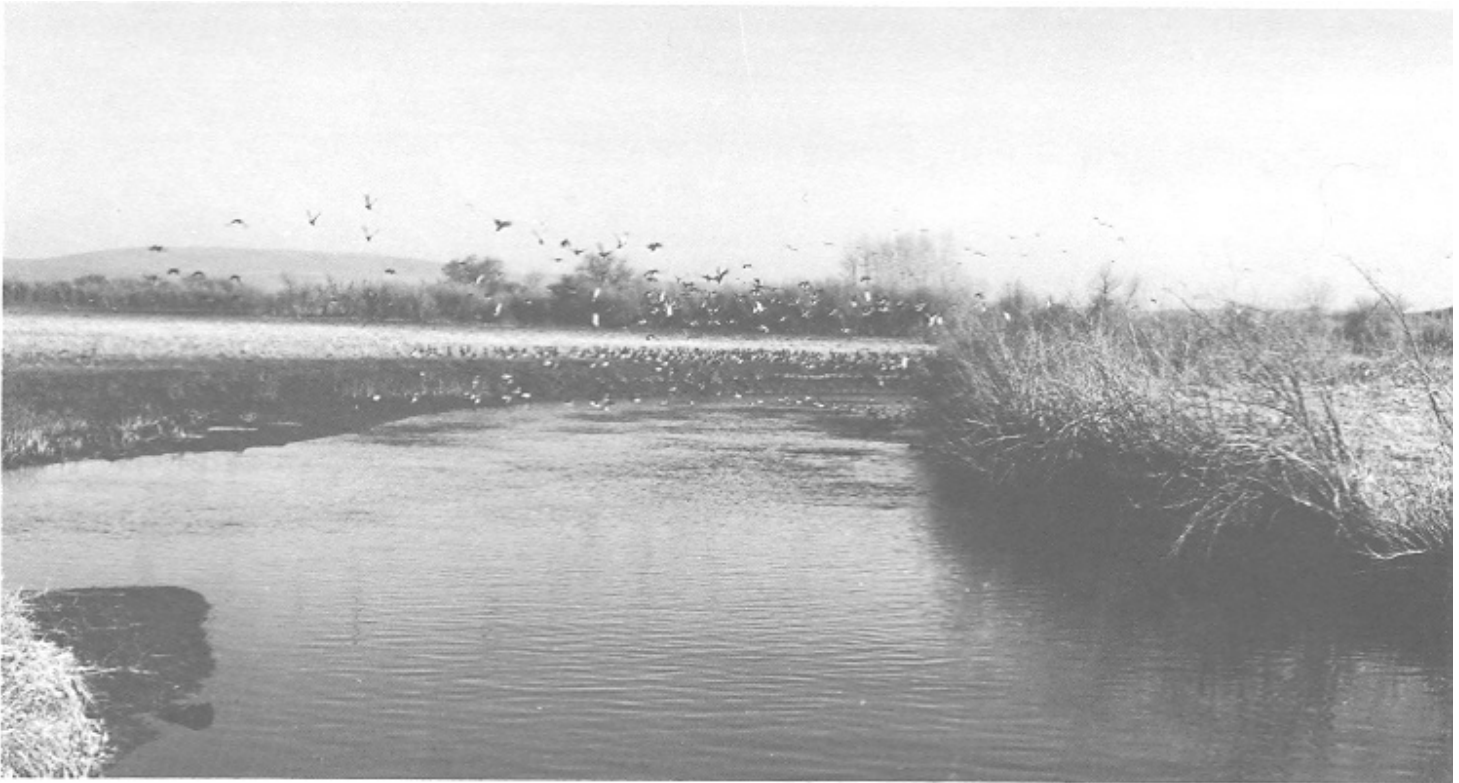
Figure 4.-Migratory ducks on Toppenish Creek. The soil is Toppenish silty clay loam.

prominent, yellowish-red (5YR 5/6) mottles; massive; hard, firm, sticky and plastic; few roots; few fine pores; thin discontinuous clay films surrounding gravel; about 55 percent gravel; strong effervescence; some disseminated and segregated lime; some gravel is lime coated on the lower side; strongly alkaline; abrupt, wavy boundary.