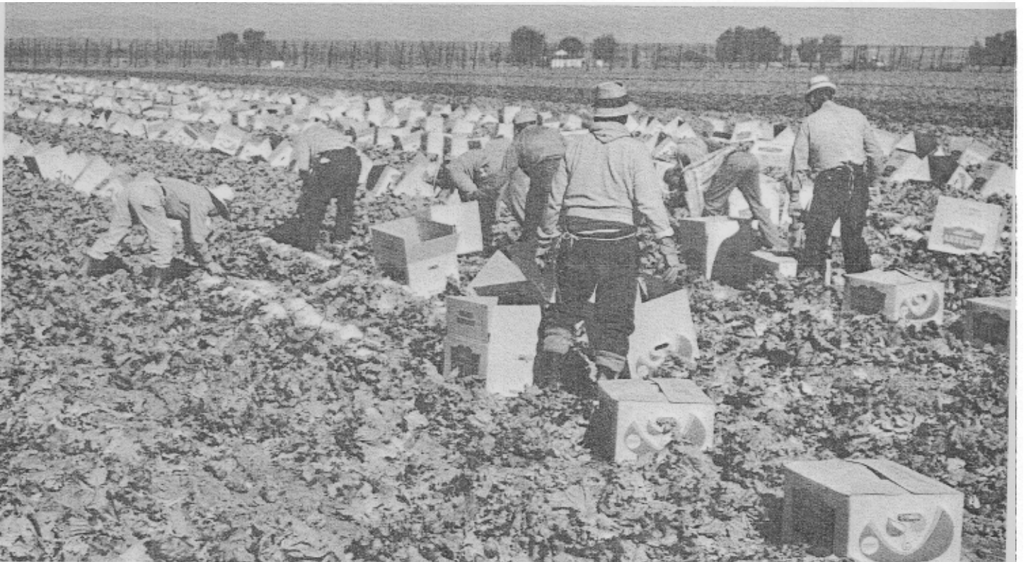
Figure 2.-Double cropping in one season on Naches loam. Top: Rows are irrigated in August after harvest of sweet corn. Bottom: Lettuce is harvested in October.