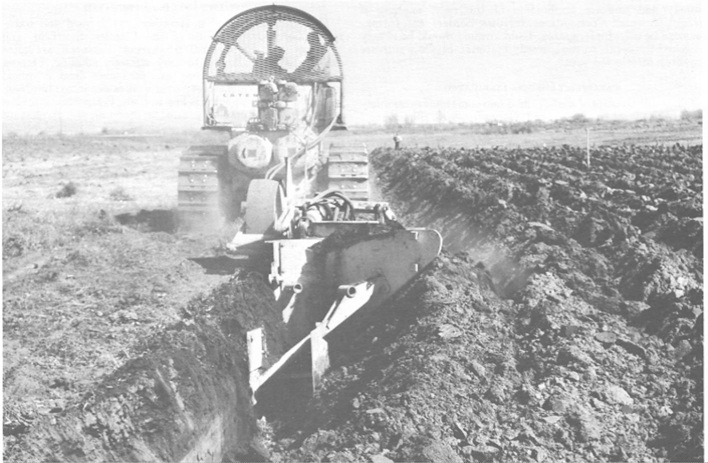
Figure 7.-Experimental deep plowing on White Swan silt loam disseminates concentrated salts.

The management needs are application of fertilizer according to the needs of the crop and utilization of crop residue and cover crops in vineyards and orchards to maintain organic-matter content. These soils are best suited to sprinkler irrigation. Furrows can be used if they are laid out on a 2 percent gradient. Land leveling should be restricted. Shallow cuts are possible in selected areas.