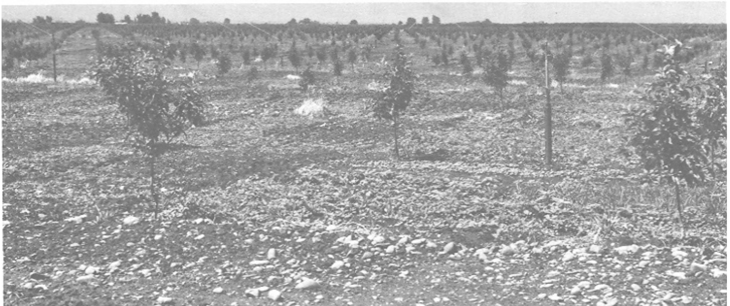
Figure 3.-Irrigated young orchard on Ashue gravelly loam. A solid set, overhead sprinkler is used for irrigation.

IIC2-36 to 62 inches, dark grayish-brown (10YR 4/2) very gravelly sand, very dark grayish brown (10YR 3/2) moist; single grained; loose, nonsticky and nonplastic; few roots; mildly alkaline.