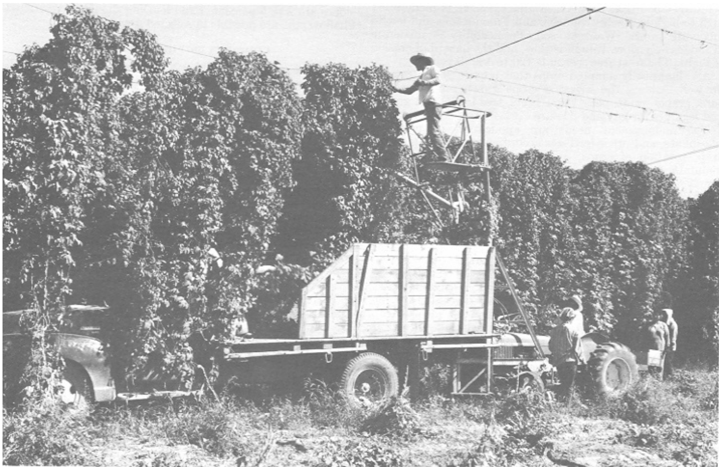
Figure 6.-Hops harvested early in September. The soil is Esquatzel silt loam.

The management needs are drainage; leaching and the possible addition of such amendments as gypsum, sulfur, sulfuric acid, or ferric sulfate to facilitate leaching; application of fertilizer according to the needs of the crop; utilization of all crop residue to maintain and improve the organic-matter content and soil structure; rotation of crops; and timely and uniform application of the right amount of irrigation water. Furrows, corrugations, borders, flooding, or sprinklers can be used for irrigating. Border irrigation and flooding, however, are not suitable where slopes are 2 to 5 percent.