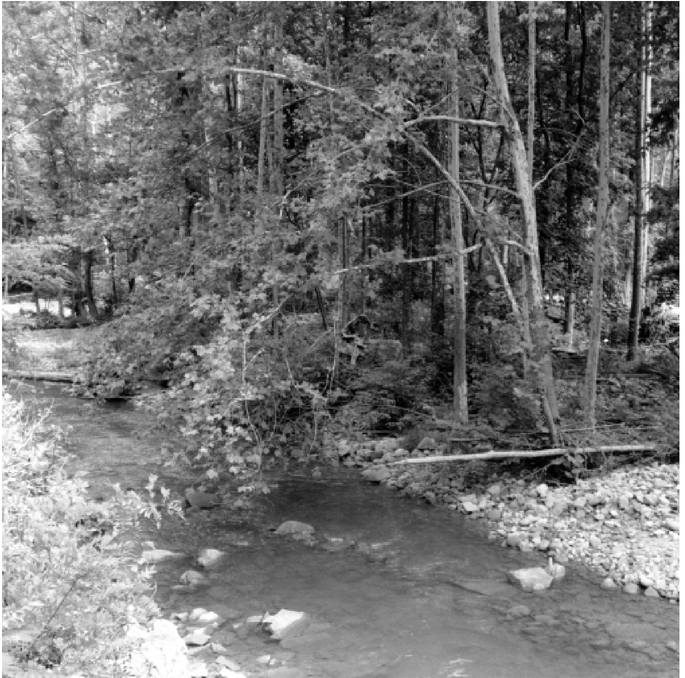
Figure 3.—Potomac soils along the Elk River in an area of Pope-Potomac complex, very cobbly.

erosion and sedimentation include leaving wide filter strips beside streams and seeding roads and landings to grasses and legumes when they are no longer being used.