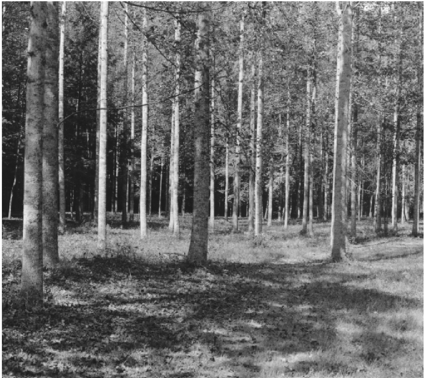
Figure 5.—A young stand of yellow-poplar in an area of Chavies fine sandy loam.

furrowing, or surface drainage, reduce the seedling mortality rate.