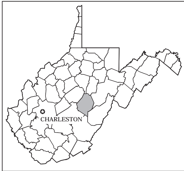
Figure 1.—Location of Webster County in West Virginia.

southern half of the county is drained by the Birch, Cranberry, Gauley, and Williams Rivers.