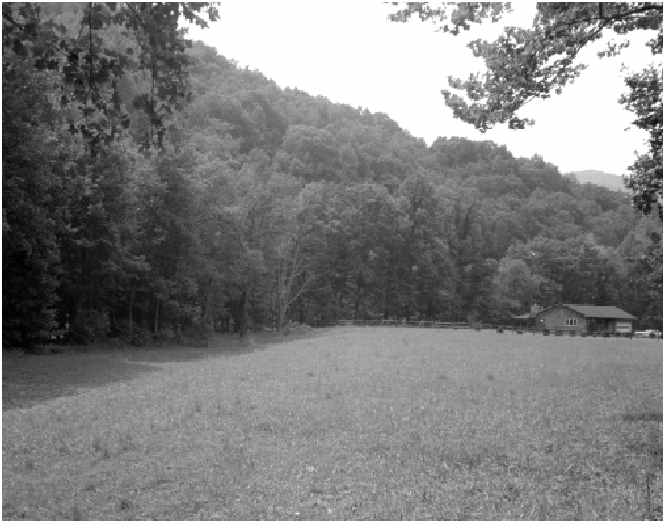
Figure 2.—Pasture in an area of Chavies fine sandy loam.

No major limitations affect the development of picnic areas, playgrounds, or hiking trails.