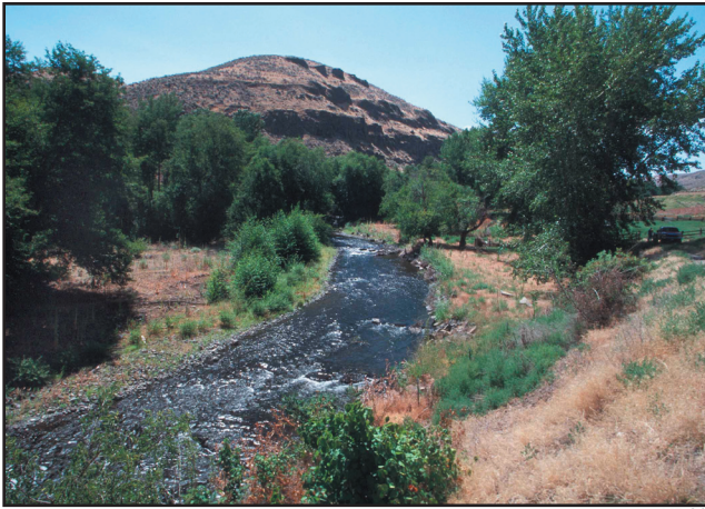
Ideal habitat interspersions for mule deer consists of a variety of vegetation types and a source of water and minerals

ed through increased landowner awareness of mule deer habitat requirements and by consequential improvement of land management to maximize habitat quality and accessibility. Unfortunately, as the needs of mule deer are usually not the primary land management goal of most private landowners in western North America, habitat improvement programs typically involve coordination of diverse interests. As such, landowners must be fully aware of the complexities of habitat enhancement programs before proceeding with management actions. One approach may lie in the design of a detailed sequential checklist outlining objectives and appropriate measures for achieving stated goals.