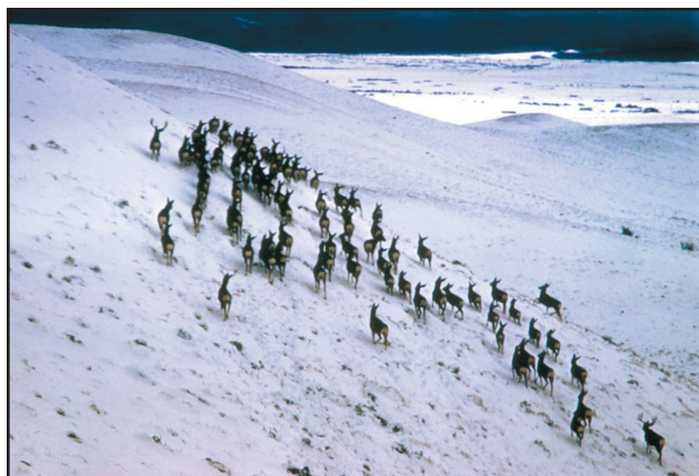
U. S. Fish and Wildlife Service

Deep snows tend to reduce usable range to a fraction of the total. In eastern Washington, for example, studies showed that deer find approximately 1 acre of usable winter range for each 15 to 20 acres of summer range. Densities may also increase as heavy snow cover concentrates individuals into areas where food is most accessible, a circumstance that may also lead to local overgrazing on the few food items available during this time.