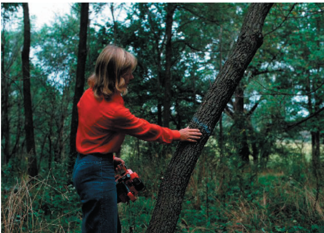
Lynn Betts, NRCS

Mule deer are large, adaptive animals that require several basic habitat components. A mix of open areas replete with edible forbs, grasses, and shrubs in close proximity to relatively large stands of woodland and brush provide cover for both predator evasion and thermal protection, and an accessible source of water constitute the predominant features of suitable mule deer habitat. Private landowners can provide quality habitat for mule deer by incorporating deer habitat requirements into land planning. Managing for the inclusion of mule deer habitat requirements will also benefit associated wildlife that depend on similar environments. Managing grazing, conducting selective timber harvest and periodic burns, providing a dependable source of water, and planting native species are some of the options that landowners may consider to benefit mule deer populations.