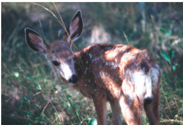
National Park Service

On average fawns weigh 6 to 8 pounds at birth and are reddish-brown with white spots that give a cryptic mottled effect. Fawns are able to stand and move about on their own within 12 hours of birth, but generally remain hidden and motionless for protection. Fawns have little or no scent and does habitually stay away from their young except to nurse so as to minimize the risk of attracting predators. Fawns begin feeding on vegetation at 2 to 3 weeks and are fully weaned at 2 to 3 months of age. Fawns grow rapidly over the summer as they take advantage of the abundance of highly nutritious forage and often reach weights of 70 to 80 pounds by the fall. A typical family group may consist of one or more females with their young, accompanied on occasion by a yearling buck. Fawns usually remain within the family group for a year, after which female yearlings may be allowed to remain while bucks of the same age are either forced to leave or depart on their own. Life expectancy for mule deer in the wild is approximately 7 to 10 years,