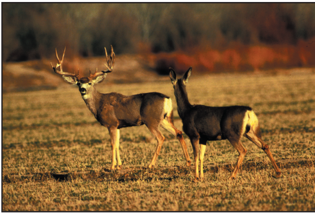
U. S. Fish and Wildlife Service

Mule deer reach sexual maturity at 1 to 2 years of age.