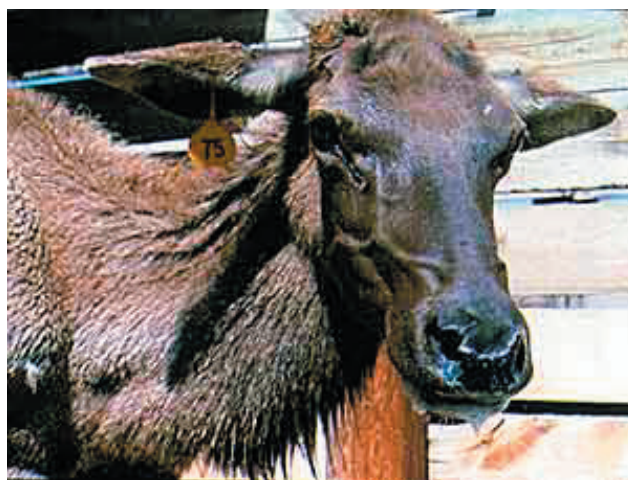
This elk has been infected with chronic wasting disease, which can also affect mule deer.

First noted among captive mule deer in Fort Collins, Colorado, in 1967, CWD has since been identified in