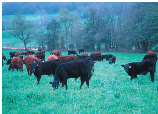
Jeff Vanuga, NRCS

Patch burning, also known as rotational grazing without fences or fire-grazing interaction, is a management practice that combines rotational grazing with prescribed burning. Large-scale uniform burns and poorly managed grazing systems can be detrimental to livestock and wildlife. Patch burning provides an alternative to traditional fire and grazing programs and a practical way to restore mule deer habitat. Patch burning allows grazing and fire to interact to cause a shifting vegetation pattern across the landscape.