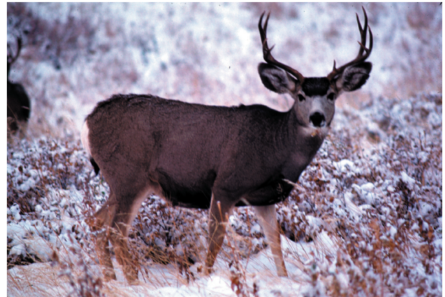
Mule deer ( Odocoileus hemionus )

Age distribution is generally classified as follows: fawn, birth to 1 year of age; yearling, from 1 to 2 years of age; adult, over 2 years of age, further subdivided into prime (3 to 6 years of age) and old (>7 years of age). While patterns or characteristics of teeth provide the most accurate indication of age among adult mule deer, other factors such as body size, hair color, and, in males, antler growth may provide a general indication of maturity. The size and number of antler points is highly variable, and depends on a combination of internal and external factors, primarily genetics, age, and nutritional status. Antlers generally increase in size and may increase in number of points as a mule deer matures. Bucks tend to produce their largest antlers at approximately 5 to 6 years of age.