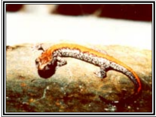
Coeur d'Alene Salamander

Hike to an area away from human activity and sit quietly for a while. Near the river you may see beaver, moose, deer, elk, black bear and an occasional mink or otter. The Selway River is also home for nesting pairs of osprey; they arrive in the spring and leave for warmer wintering grounds in the fall. The endangered bald eagle, on the other hand, uses the river during the winter. Other birds that can be seen are wild turkeys, heron and the dipper.