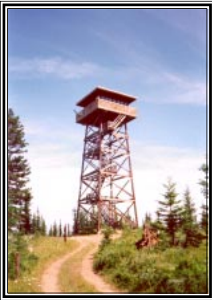
Lookout Butte Fire Tower