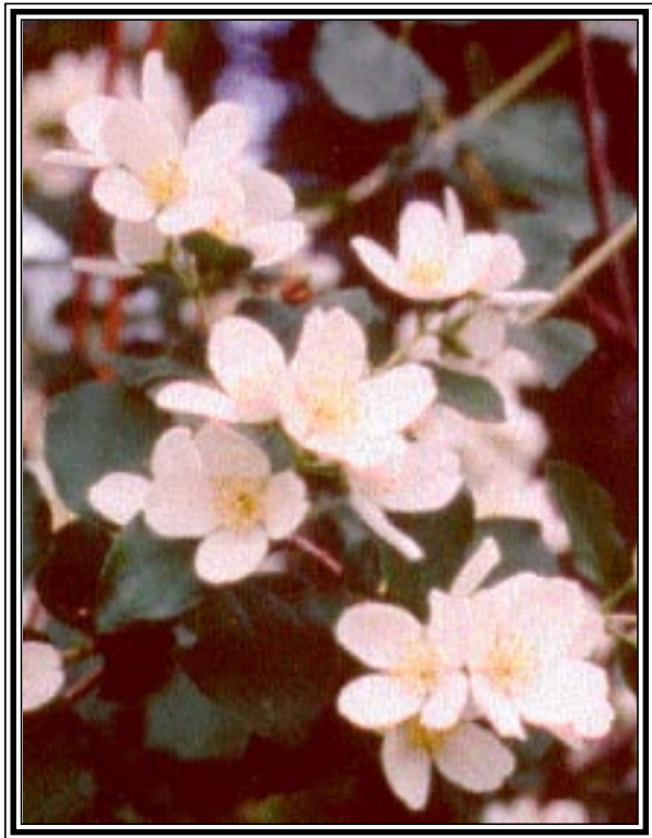
Syringa, Idaho's state flower; blooms on the Selway from May to July