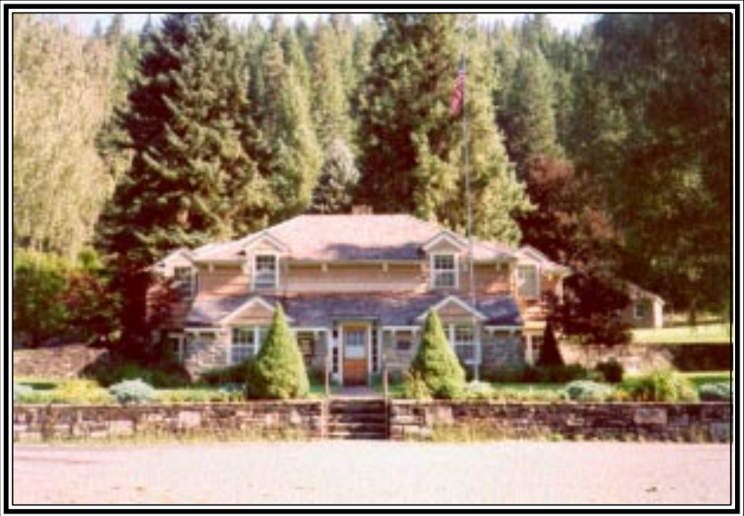
Historic Fenn Ranger Station

to the Selway River Corridor of the Moose Creek Ranger District. The beautiful Selway River, flows through the heart of this wild and rugged land. Congress designated the Selway River as an outstanding national resource under the Wild and Scenic River Act in 1968. This country is known for its extraordinary scenery, exceptional water quality and excellent wildlife viewing opportunity.