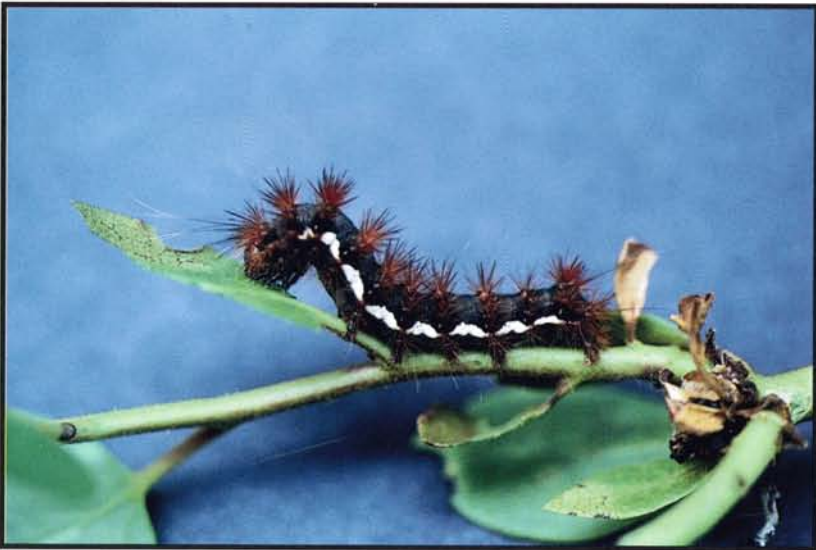
Figure 24 —An unusual noctuid larva, Acrionicta perdita Grote (Lepidoptera: Noctuidae).