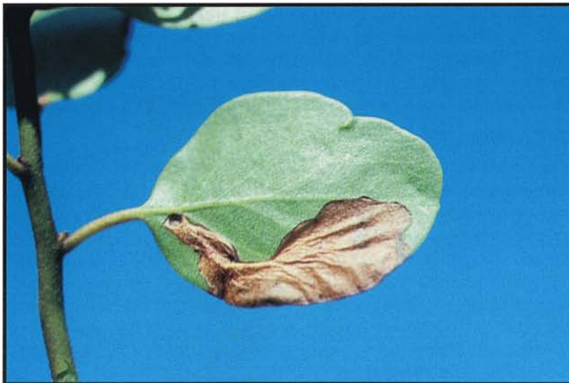
Figure 9 —Characteristic leaf mine caused by Epinotia miscana (Kearfott) (Lepidoptera: Tortricidae) (note adult exit hole near base of leaf).