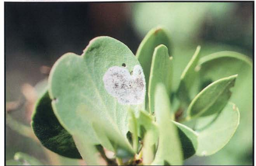
Figure 8 —Blotch mine caused by an undetermined species (Lepidoptera: Gracillariidae).