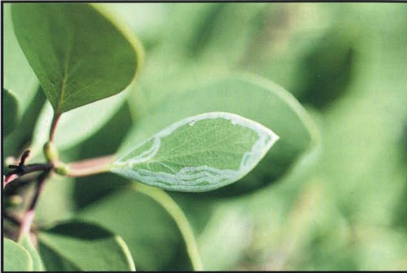
Figure 7 —Serpentine mine caused by an undetermined species (Lepidoptera: Gracillariidae).