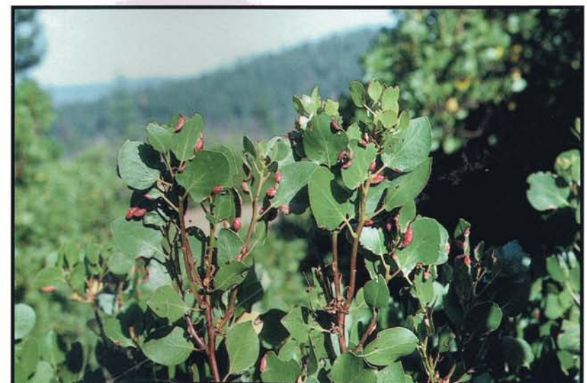
Figure 10 —Greenleaf manzanita plant infested with leaf galls caused by the manzanita leaf gall aphid, Tamalia coweni (Cockerell) (Homoptera: Aphididae). Emerging alate forms are sexual winged males and females which mate and produce eggs that overwinter.