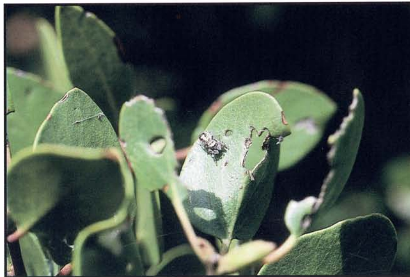
Figure 30—Unidentified jumping spider (Araneae: Salticidae).

were encountered in greenleaf manzanita brushfields. These included a tick (Acari: Ixodidae), two black flies (Diptera: Simuliidae), a midge (Diptera: Chironomidae), and four deer flies (Diptera: Tabanidae). Seventy-nine parasitoids were collected from two orders and 19 families, many of which we reared from known hosts (table 1).