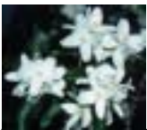
Meriwether Lewis catalogued and described syringa in 1806. Idaho's state flower, it bursts into bloom in early summer, its white blossoms smelling like an orange tree in bloom.

Plant life in the river canyon ranges from giant cedar trees to tiny buttercups. You can even find "coastal disjunct" plants, remnants from a time long ago when a temperate climate prevailed.