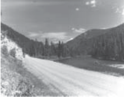
U.S. Highway 12, 1962

Construction of a highway through the Lochsa River canyon began in the early 1900s on both east and west ends. Work continued over the years until the highway opened in 1961.