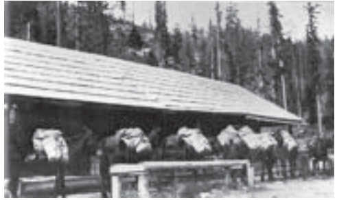
A pack string is loaded and ready for work at the Lochsa Ranger Station in the 1930s.

Turn off Highway 12 at the junction to Powell Ranger Station. Here you'll find a campground and a rustic resort providing tourist services.