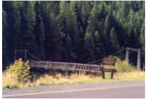
Pack bridges cross the Lochsa River, providing hikers and stock users access to Selway-Bitterroot Wilderness trails.

From Highway 12 cross the Lochsa River on pack bridges which lead to Wilderness trails (foot or stock traffic only on bridges and Wilderness trails). You'll find parking for stock trailers and access for stock at most trailheads.