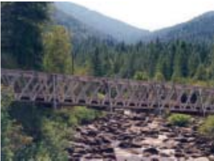
Trail 211 winds into the Selway-Bitterroot Wilderness after crossing Boulder Creek.

Cross the pack bridge and follow Trail 206 for 2-3 miles through cool cedar groves. Trail mostly follows a rocky, rugged, high ridge.