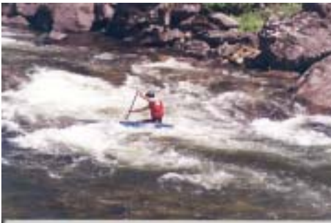
Kayaker on the Lochsa River works to turn the craft in swift water.

You do not need a permit to raft or kayak the Lochsa. For your free brochure showing rapids locations and ratings, contact the Kooskia Ranger Station.