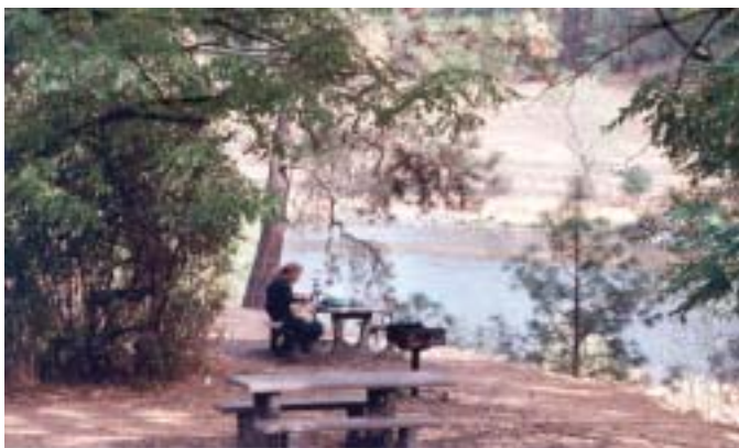
The Middle Fork of the Clearwater River flows by as a visitor enjoys lunch in the shade. Enjoy your stay at any one of the picnic areas or campgrounds along Highway 12.