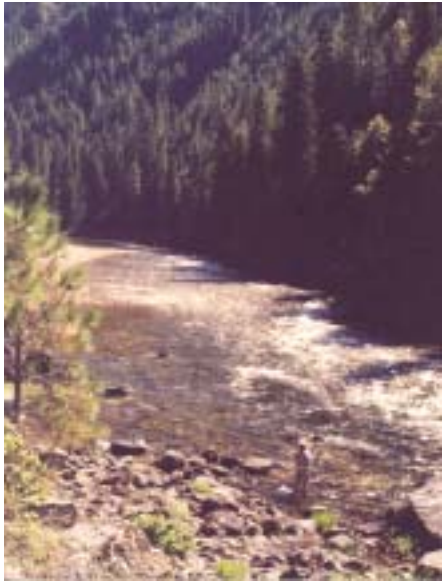
An angler wets a line in the Lochsa River. Across the way, the Selway-Bitterroot Wilderness begins at the river's edge.

Deer, elk and black bear move along the hillsides. Moose graze in meadows and wet areas. Canada geese, swans, eagles, osprey and great blue herons reside along the river's banks and swim on its waters. At lower elevations wild turkeys thrive. Mountain lions, snow geese and Harlequin ducks make a rare appearance.