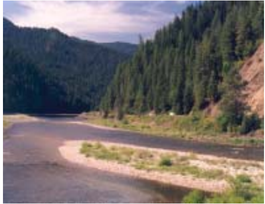
At Lowell the Lochsa River joins the Selway River, and the two become one. The canyon begins to widen, and the Middle Fork of the Clearwater River seems to slow down.

Over the millenia the Nez Perce people (Nimiipuu) lived, hunted, gathered roots, camped and fished here. They traveled across the ridgeline route north of the highway to hunt buffalo.