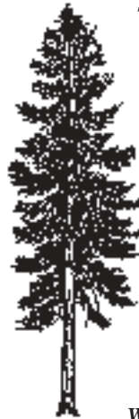
Grand fir, also known as white fir, is one tree species you'll see along Warm Springs Trail 49.

Cross the Warm Springs Pack Bridge to get on Trail 49. It follows Warm Springs Creek through old-growth cedar, spruce, fir and lodgepole.