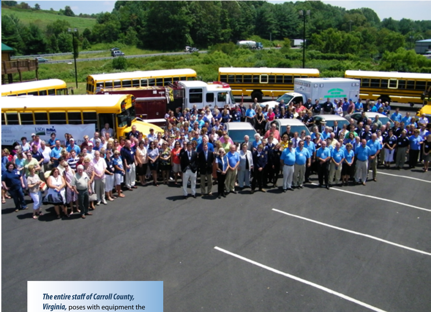
The entire staff of Carroll County, Virginia, poses with equipment the county has obtained through the Community Facilities Programs.

The community of North Logan and the residents of Cache County, Utah, were in need of a clinic. USDA Rural Development provided a loan to purchase a building to house the Cache Valley Community Health Center. The Center is a unique "one-stop-shop" facility that serves the uninsured, underinsured, and the insured. Low-income families are charged on a sliding scale, dependent on family size and income. The Center offers multiple methods of care, including a full-time pharmacy, preventative and primary medical care, dental treatment, and behavior health services.