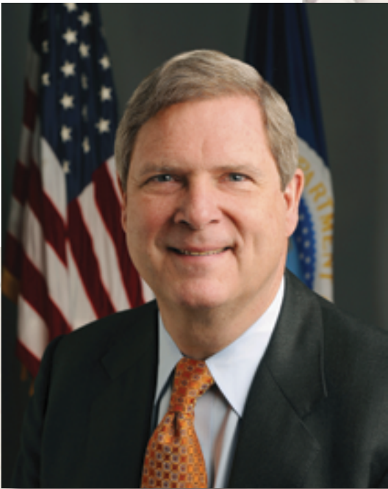
Tom Vilsack Secretary of Agriculture

Since fiscal year 2009, Rural Development's Community Facilities Program has helped more than 37 million rural Americans address essential challenges in health care, education, public service and public safety by financing projects through loans, grants, or loan guarantees.