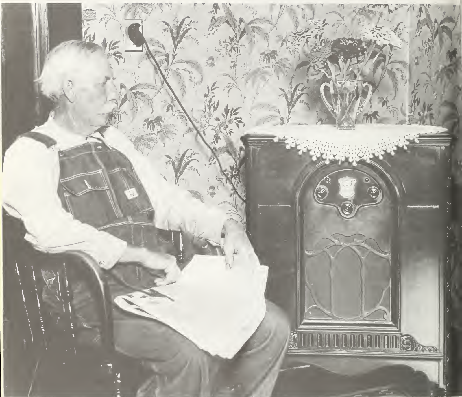
In the past, farm families relied on the radio as a vital link in keeping abreast of world events and current agricultural information.