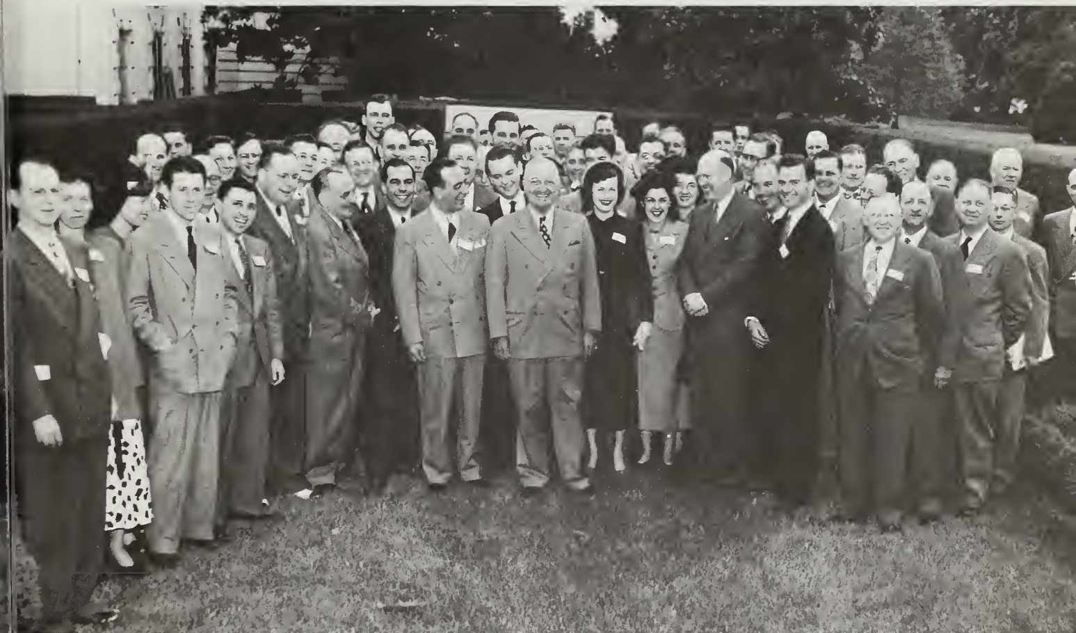
President Harry Truman with the Radio Farm Directors at a White House conference held on May 2, 1949.