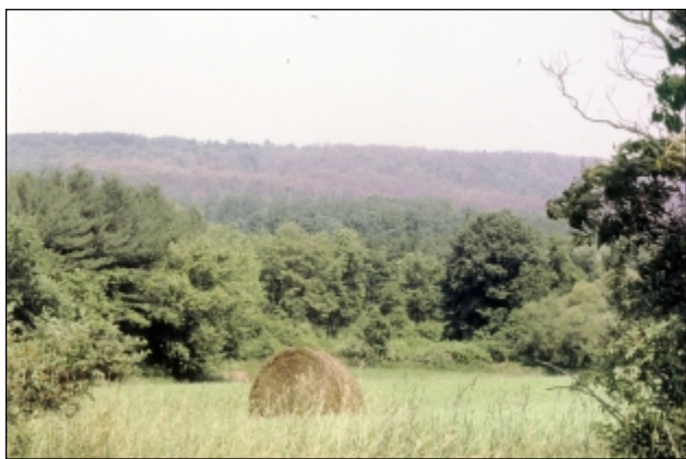
Figure 2 —At first glance, this appears to be a beautiful forest, but nearly half the trees in the background have been defoliated by the gypsy moth. Defoliation alters habitat, adversely affecting canopy and understory ecosystems.

If you live where the gypsy moth is prevalent, you know the damage the larval stage of this insect can cause. Those leaf-eating caterpillars devour the leaves of many hardwood trees and shrubs, giving summer scenes a barren, wintry look. Gypsy moth larvae have been known to defoliate up to 13 million acres of trees in 1 season, damaging local ecosys-