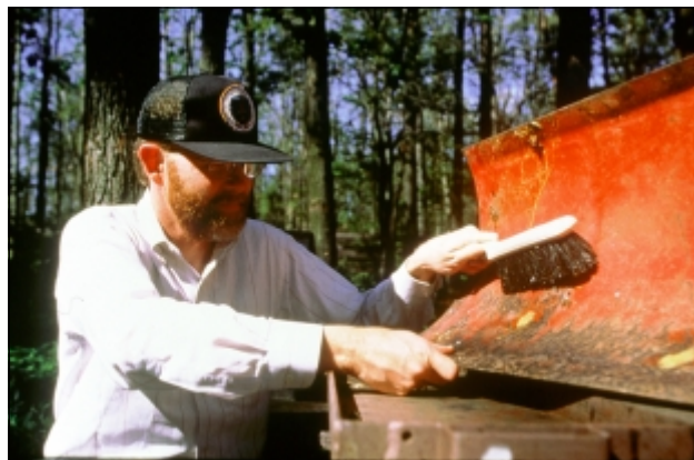
Figure 11 —Make sure to turn over farm implements and other equipment that can conceal egg masses from view and provide protection against predators and harsh winter weather.

Remember, you are the key to preventing the interstate movement of gypsy moths on outdoor household articles, including recreational vehicles. Do your part to prevent the spread of this pest.