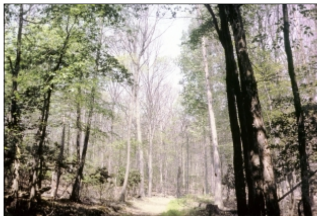
Figure 3 —A severe infestation can leave trees barren in the middle of the summer. Then, in an attempt to releaf, trees use up stored energy and become stressed.

Failure to inspect household articles for gypsy moth life stages prior to movement from a regulated area is a violation of USDA quarantine regulations and may result in significant civil penalties. Inspecting your personal property for gypsy moths goes beyond being a good neighbor: it is required by law. Don't be responsible for moving an old pest to a new neighborhood.