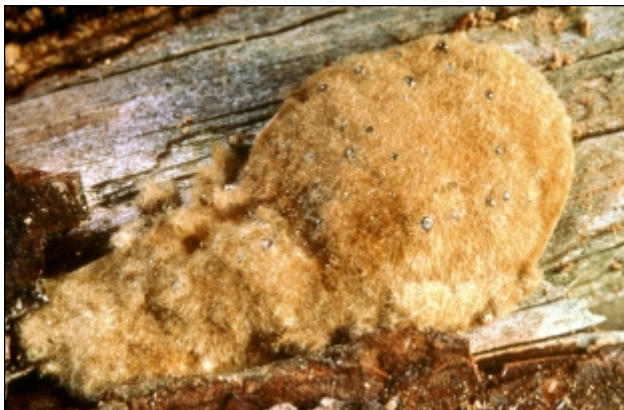
Figure 5 —The gypsy moth egg mass is covered with buff or yellowish “hairs,” giving it a velvety appearance.

If you choose to inspect your outdoor household articles, you need to be able to identify gypsy moth life stages. Most important is the egg mass. This publication contains photographs to help you.