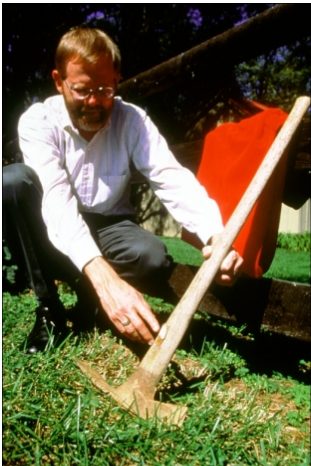
Figure 10 —Yard tools left outside during the spring and summer months are a favorite spot for female gypsy moths to deposit egg masses.

An effective way to dispose of gypsy moth life stages is to remove them by hand. Scrape egg masses from their locations with a putty knife, stiff brush, or similar handtool. Dispose of egg masses and other life stages in a container of hot, soapy water, or place them in a plastic bag, seal it, and set it in the sun. You may elect to abandon articles if they are heavily infested and of little value to you.