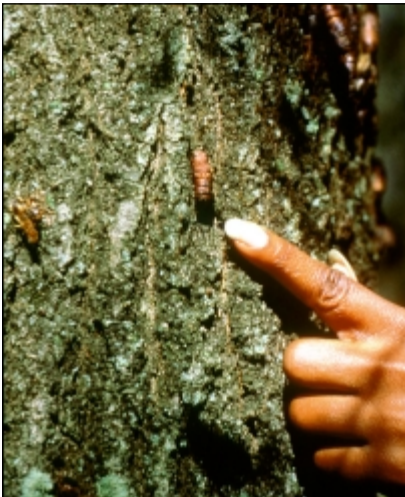
Figure 8 —Adult gypsy moths emerge in the summer from dark-brown pupal cases that can remain on trees and other surfaces after the moths are gone.

Caterpillars stop feeding when they enter the pupal or "cocoon" stage, ranging from May in southernmost infested States to early July in northernmost infested States, varying with weather and climate. Adult moths emerge from the dark-brown pupal cases 10 to 14 days later. Males have light tan to brown wings marked with dark, wavy bands, and a 1.5-inch wingspread. Female moths are larger than males and generally white, with a wingspread of about 2.5 inches. Despite having larger wings, the female moths cannot fly.