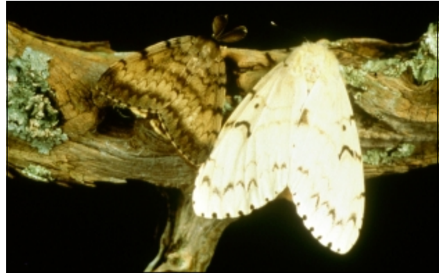
Figure 9 —The adult female gypsy moth is about twice the size of the male and white in color.

Neither sex feeds in the moth stage; adults mate and lay eggs only. The eggs are the dormant stage of the life cycle, allowing the pest to survive winter weather. In the spring the eggs hatch, starting the life cycle over again.