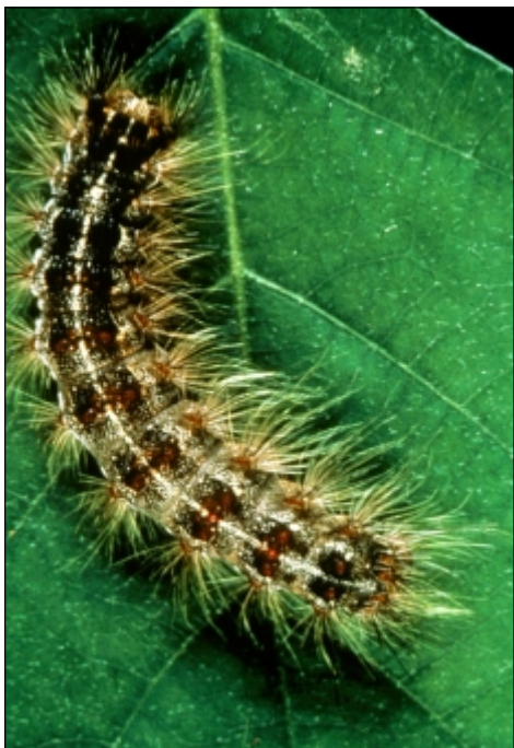
Figure 6 —Identifying gypsy moth larvae is easy because they have several pairs of blue and red dots on their back.

The gypsy moth goes through four stages of development—egg, larva (caterpillar), pupa (cocoon), and adult (moth). It has one generation a year. During the summer months, female moths attach egg masses to trees, stones, walls, logs, and other outdoor objects, including outdoor household articles. Each egg mass contains up to 1,000 eggs and is covered with buff or yellowish “hairs” from the abdomen of the female. The velvety egg masses vary in size but on average are usually about an inch and a half long and three-quarters of an inch wide (a little bigger than a quarter).