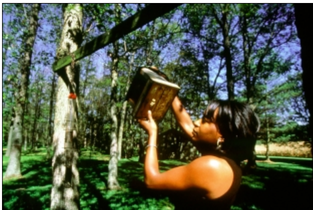
Figure 4 —If you inspect for gypsy moths on your own, make sure to thoroughly check all outdoor household articles for egg masses and remove and destroy them.

If you decide to do the inspection yourself, include anything accessible to a gypsy moth. Inspect any article left outdoors, stored in areas open to the outside, or stored indoors but used outdoors.