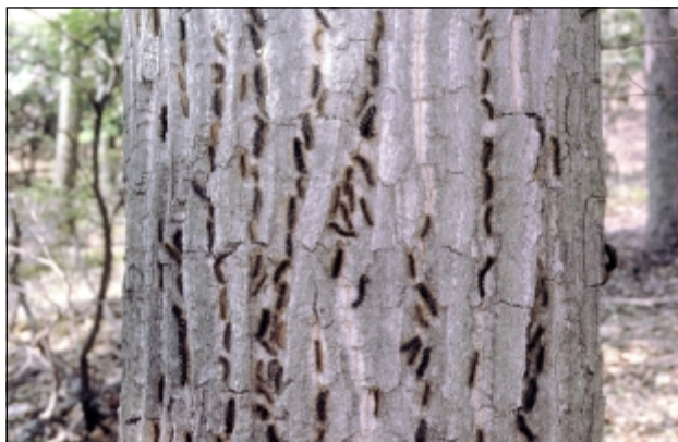
Figure 7 —Gypsy moth caterpillars survive in high numbers in North America because here, unlike Europe, they don't have many natural enemies.

In southernmost infested States, eggs begin hatching in late March. Hatching starts around early May in the northernmost infested States. The grayish, hairy caterpillars are tiny at first but easy to identify when about half-grown because they have pairs of red and blue dots on their back. Mature caterpillars are from 1.5 to 2.5 inches long. These caterpillars are voracious feeders and, in outbreak situations, can devour all the leaves from the trees and plants in entire neighborhoods and forests.