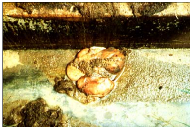
Placenta with fetu. Abortion is commonly seen in infected pregnant dams.

Infected animals may exhibit some or all of the following clinical signs: