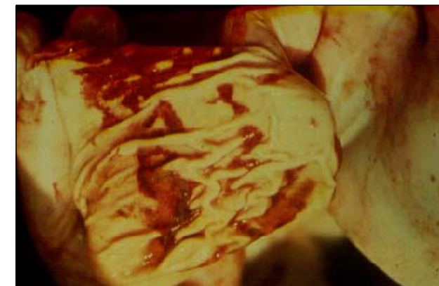
Postmortem inspection reveals congestion in the fundic portion of the stomach.

Hogs dying from the milder, chronic strains may also have secondary infections, which complicate the clinical and postmortem picture.