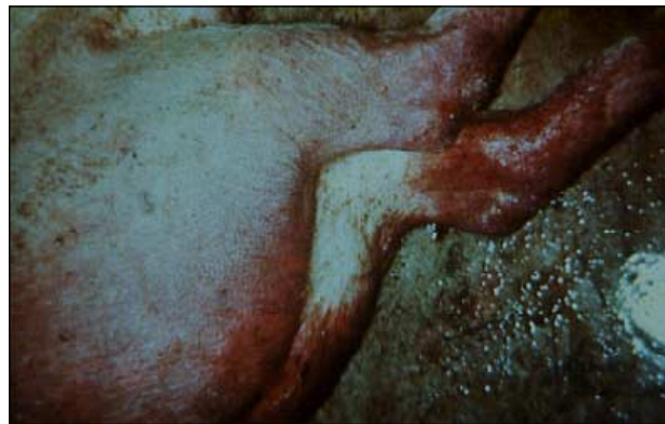
Infected pigs often experience bloody diarrhea.