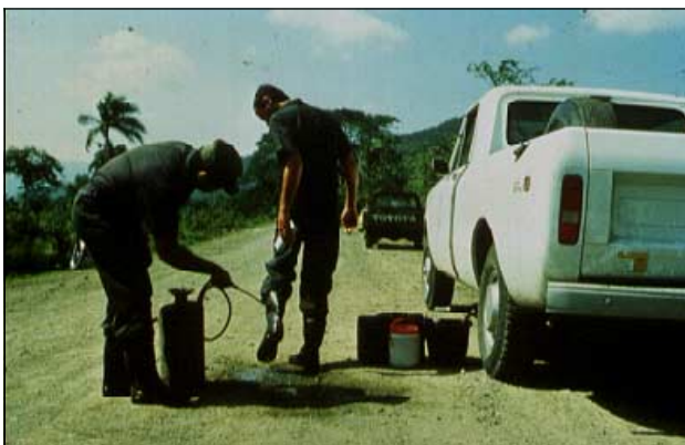
To prevent the spread of ASF, disinfect clothing, footwear, equipment, and vehicles.

Many outbreaks have been traced directly to uncooked garbage fed to hogs.