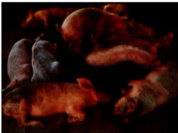
African swine fever can kill almost all pigs that become infected.

The global threat of ASF became apparent when it appeared in Portugal in 1957. This first incursion was