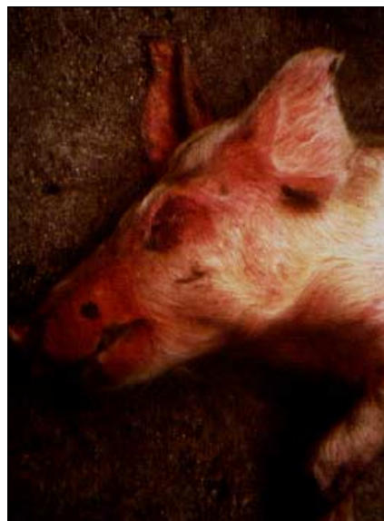
Reddening of the ears and snout is a typical sign of ASF.

Fifty percent or more of a herd affected with the subacute form of ASF may survive the acute phase of the disease. However, survivors will carry the virus for months.