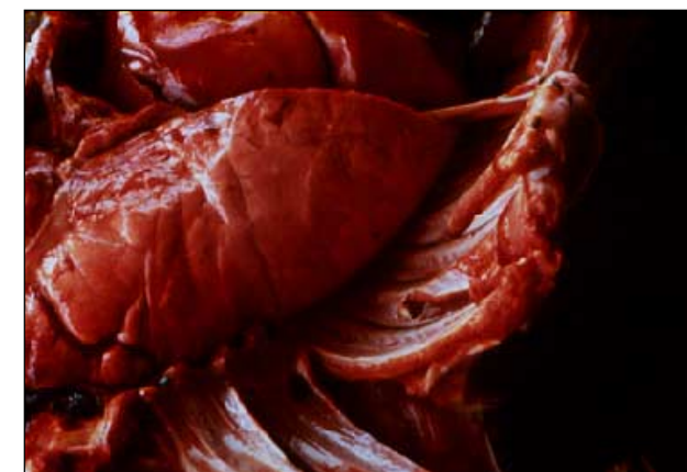
Lungs from a pig that died of acute ASF show interlobular edema.