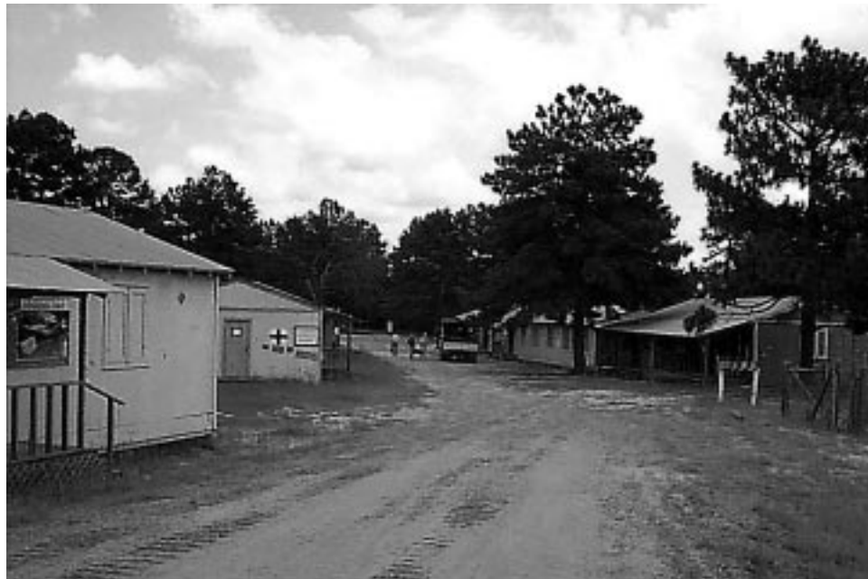
Figure 3: Mock Civilian Village at the Joint Readiness Training Center

The NTC and the CMTC sponsor exercises designed to train armor and mechanized infantry units, such as those from the 1st Armored and 3rd Infantry Divisions, in a high intensity threat environment. The JRTC provides nonmechanized or light forces, such as the 82nd Airborne and the 10th Mountain Divisions, with exercises in a low-to-medium threat environment. Both centers, however, do provide training for task forces made up of heavy and light units operating together. The CMTC and the JRTC also have constructed mock towns for training in urban warfare. Forces from the other military services as well as special operations units are also brought into the exercises at all three centers. Brigades and battalions deploy to these centers with their associated combat service and service support units.