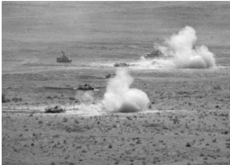
Figure 1: Desert Environment at the National Training Center

The Combat Maneuver Training Center is the only training area available to Army forces in Europe for the conduct of battalion-level exercises. According to center officials, geographical limitations of the center's rolling wooded terrain do not allow brigades to train at doctrinal distances, and two battalions can only train simultaneously with some acknowledged doctrinal degradation. (See fig. 2.)