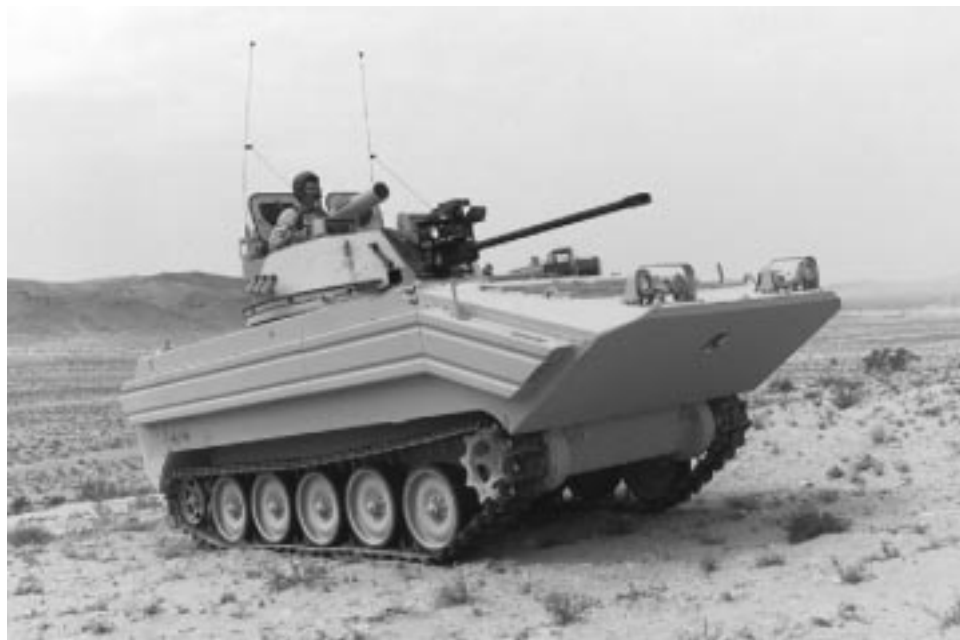
Figure 4: Opposing Force Vehicle and Soldier at the National Training Center

At the NTC and the JRTC, the Army has established pre-positioned stocks of equipment that units draw and use during the exercises. The NTC equipment consists of about 3,800 major pieces of equipment, including tanks, fighting vehicles, artillery pieces, personnel carriers, recovery vehicles, and various types of wheeled vehicles. Generally, units training at the NTC ship their wheeled vehicles and unique equipment items to the center, and they draw their tracked vehicles from the pre-positioned stocks. The pre-positioned equipment at the JRTC consists of about 1,100 major pieces of equipment, mainly wheeled vehicles. Units ship their tracked vehicles to this center for training. The CMTC does not have a pre-positioned stock of equipment.