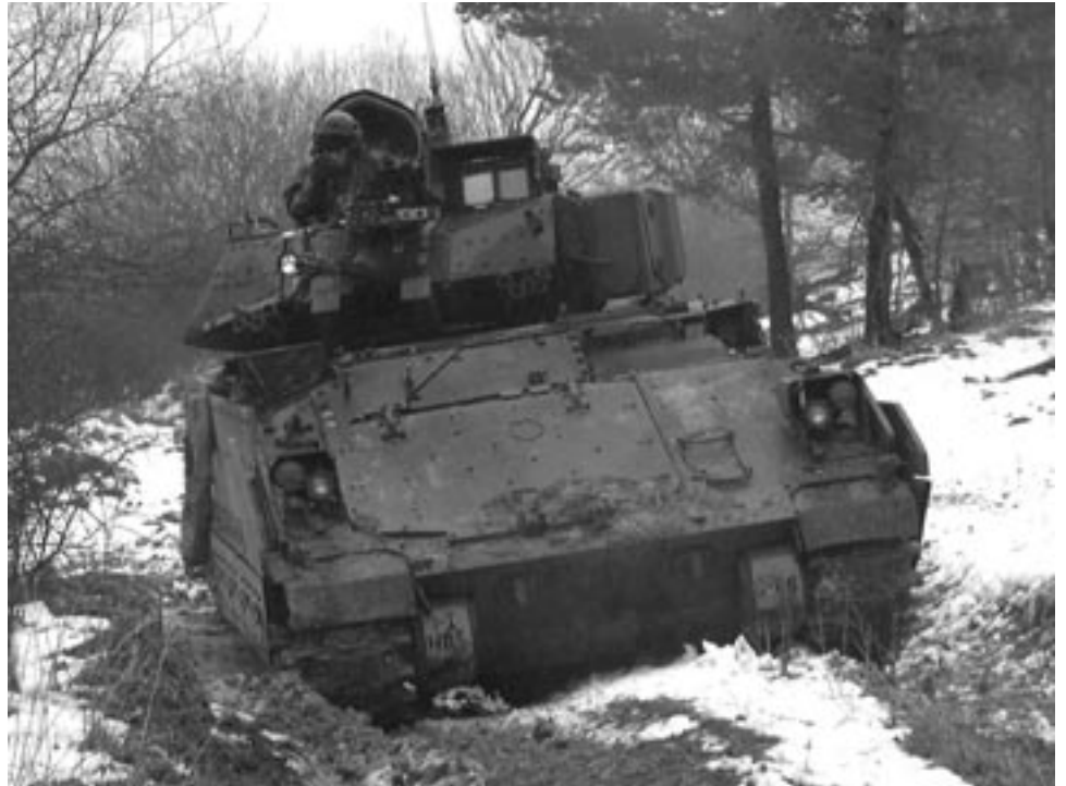
Figure 2: Wooded Terrain at the Combat Maneuver Training Center

The training areas at the Joint Readiness Training Center include swamplands, dense forests, and simulated civilian villages complete with role players, as figure 3 shows.