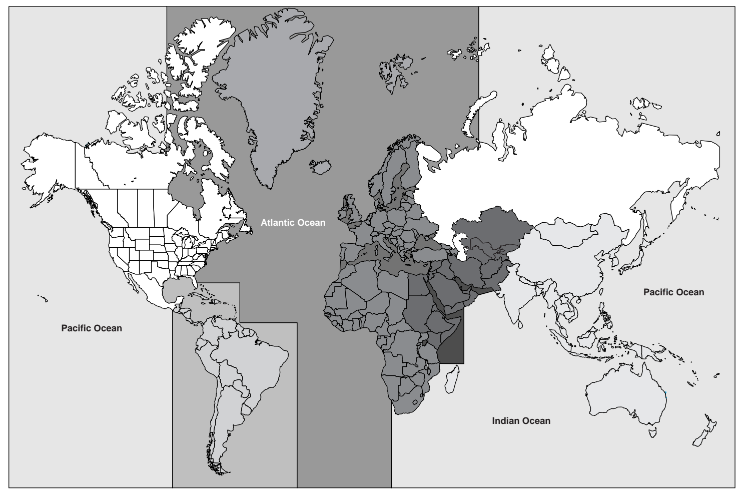
Figure 1.2: Areas of Responsibility Assigned to Geographic CINCs