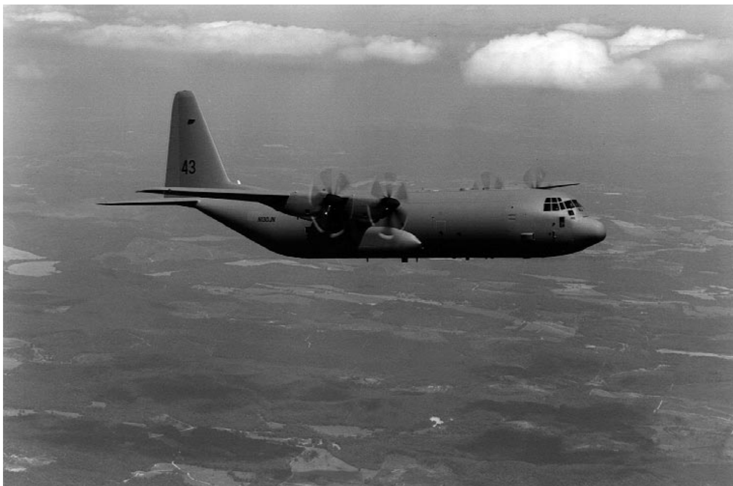
Figure I.1: C-130J-30