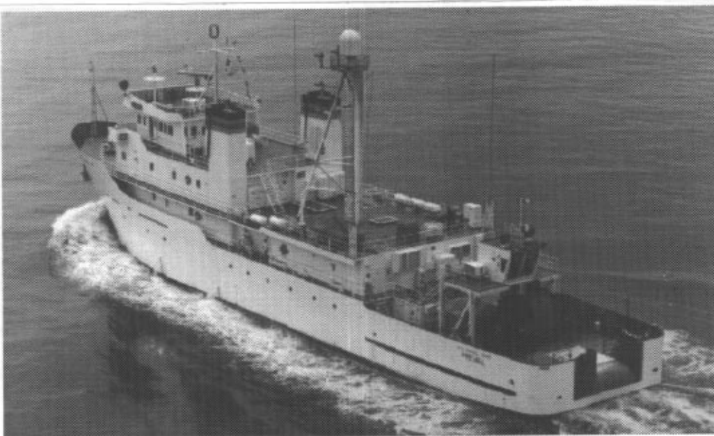
T-AGOS Surveillance Ship