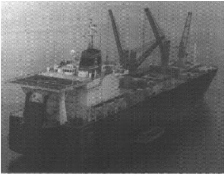
Maritime Prepositioning Ship