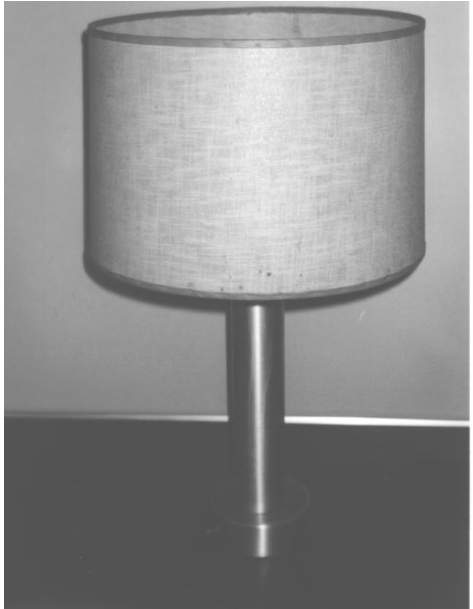
Figure 2.1: Example of the Type of Lamp Repaired by a Subcontractor