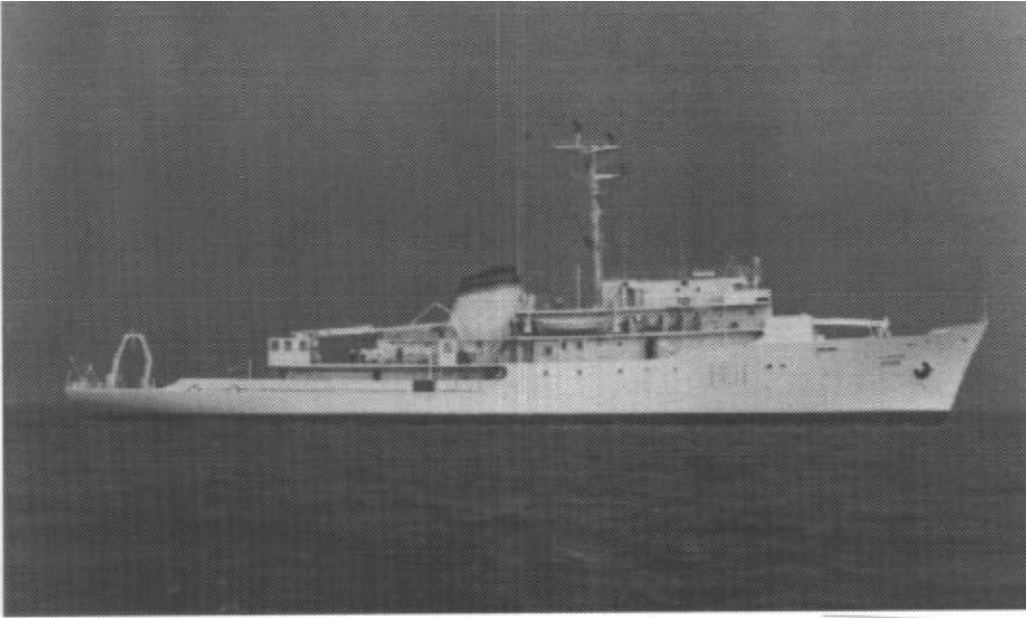
Oceanographic Survey Ship