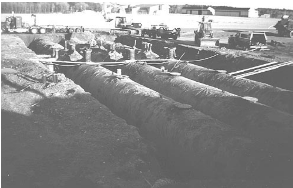
Figure 3: Underground Fuel Storage Tanks at Pease Air Force Base

If these same procedures were used at DOD facilities where favorable soil conditions existed, costs could be reduced. At Norton Air Force Base, the Air Force has spent about $5 million to remediate about 20,000 cubic yards of contaminated soil at former underground storage tank sites. Air Force officials estimate that about 20 percent of the cleanup may not have been needed and could have been left to natural processes. At Pease Air Force Base, officials estimated that about $2.5 million was spent to clean up fuel contaminated soils around 10 pumphouses. Figures 3 and 4 show underground tank removal operations at Pease Air Force Base. At Mare Island Naval Shipyard, Navy officials estimate that about 50 underground storage tanks and about 42,000 feet of abandoned underground fuel lines require cleanup at an estimated cost of $26.9 million. Under the new policy for underground storage tank cleanups, this estimate may be reduced to $13.5 million. However, Air Force and Navy officials noted that the new policy is not statewide at this point and is being adopted only in certain regions of the state.