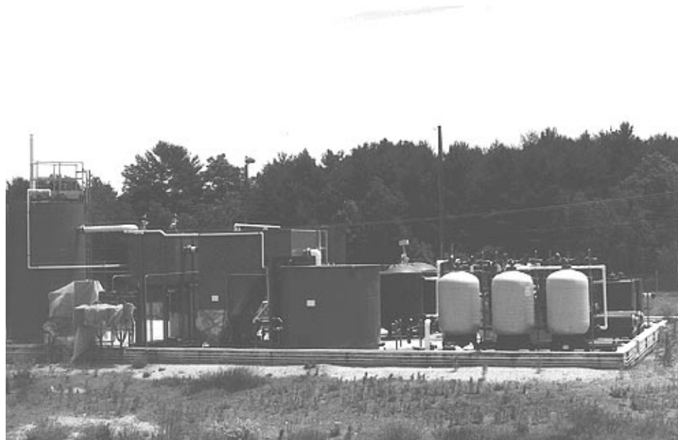
Figure 2: Pump and Treat System at Pease Air Force Base