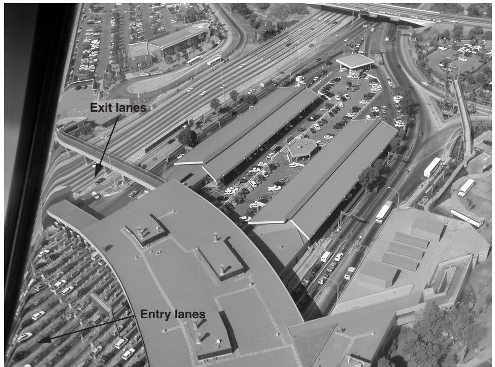
Figure 3: Aerial View of San Ysidro, California, POE