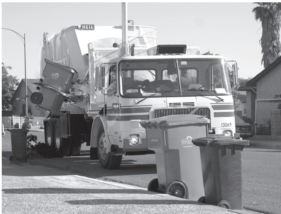
Figure 1: Curbside Recycling in San Jose, California