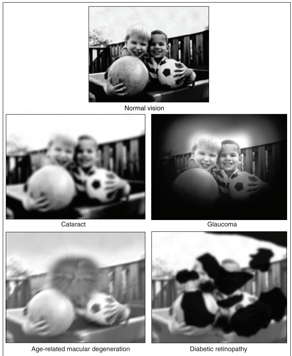
Figure 2: Vision and Vision Loss Due to Age-Related Eye Diseases