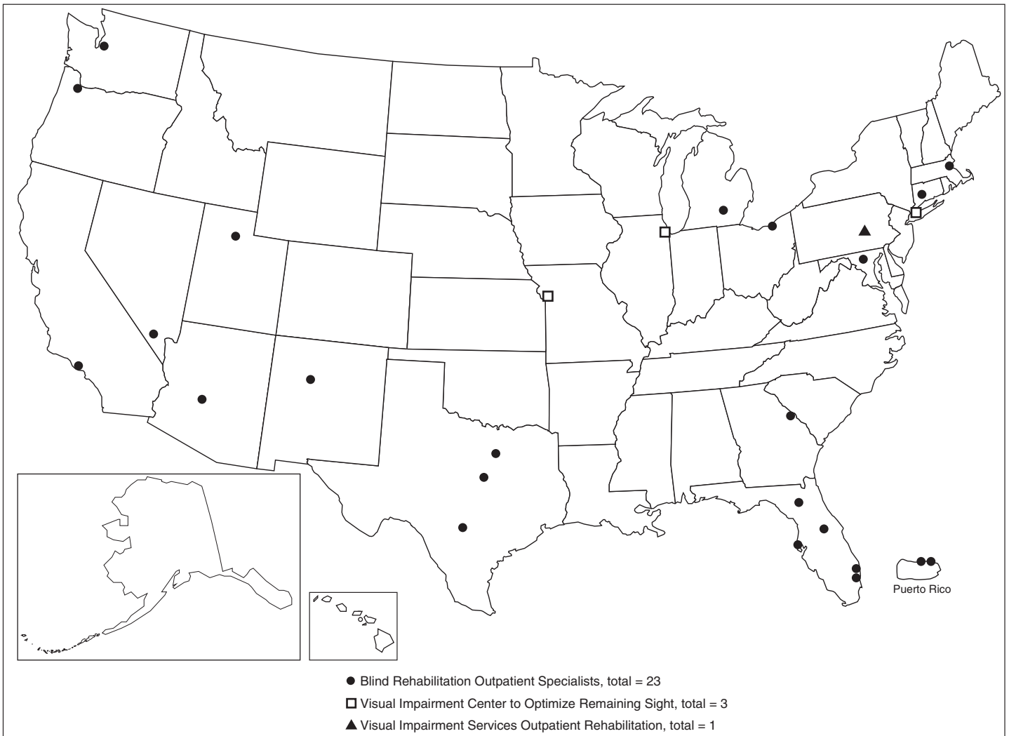
Figure 3: Locations of VA Outpatient Blind Rehabilitation Services, May 2004