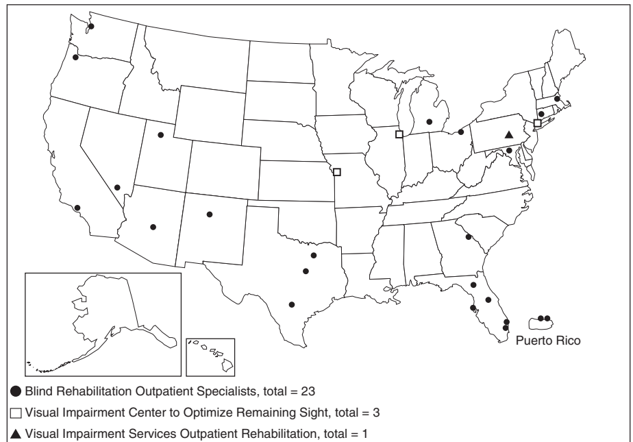
Locations of VA Outpatient Blind Rehabilitation Services, May 2004

VA provides three types of blind rehabilitation outpatient training services. These services, which are available at a small number of VA locations, range from short-term programs provided in VA facilities to services provided in the veteran's own home. They are Visual Impairment Services Outpatient Rehabilitation, Visual Impairment Center to Optimize Remaining Sight, and Blind Rehabilitation Outpatient Specialists.