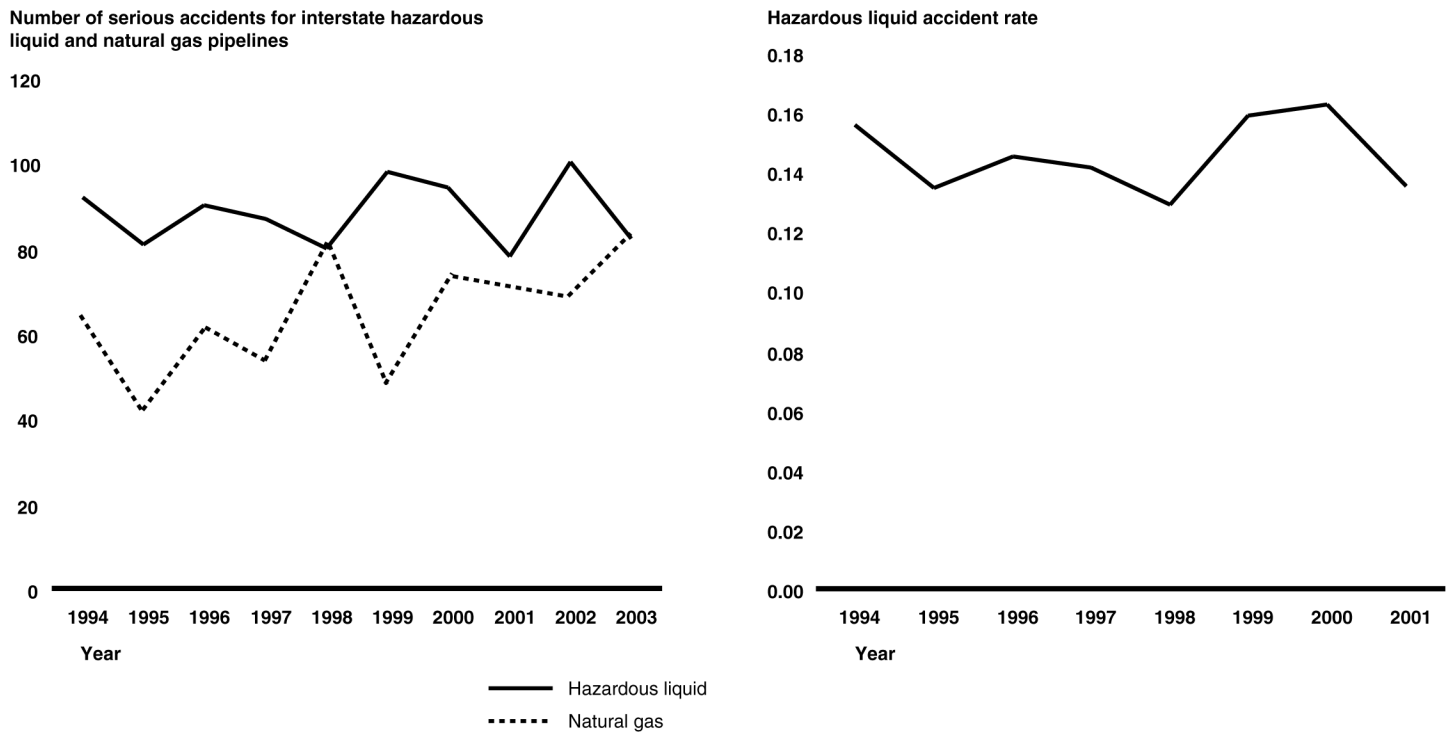
Figure 1: Numbers of Serious Accidents and Accident Rate for Interstate Pipelines, 1994 through 2003