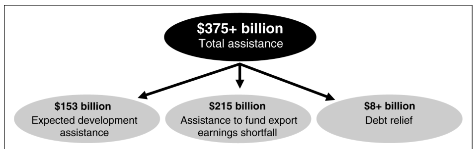
Estimated Cost to Achieve Economic Growth and Debt Relief Targets for 27 Countries through 2020 in 2003 Present Value Terms