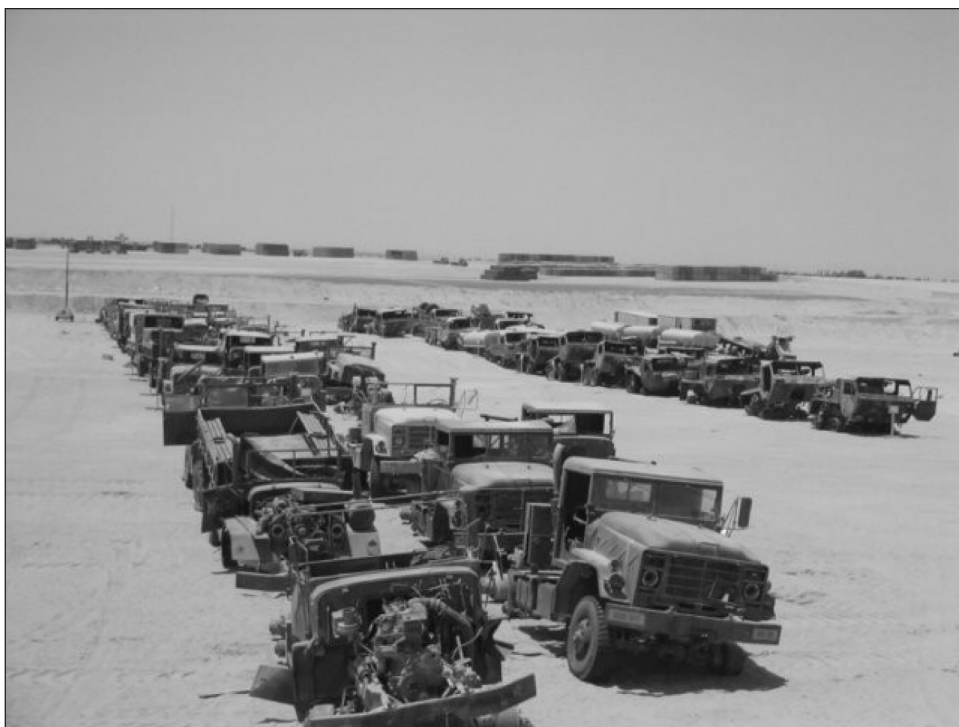
Figure 2: Some Trucks Used in OIF that Need Repair