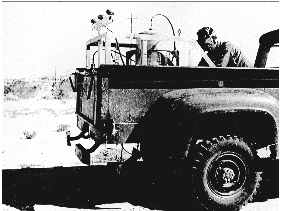
Figure 1: Dispensing Chemical Simulants during a Land-Based Test

Of the 50 Project 112 tests that DOD conducted, 19 were ship-based and 31 were land-based. (See fig. 1 for an example of land-based testing.) According to information provided to VA, the ship-based tests occurred, among other places, in the Pacific Ocean off the Hawaiian Islands and off the coast of San Diego, California; in the Atlantic Ocean off Newfoundland; in the Pacific off the Marshall Islands; and off Vieques Island, Puerto Rico. The land-based tests were conducted in Alaska, Utah, Canada, the Panama Canal Zone, and the United Kingdom. The tests were conducted from December 1962 through May 1974. (See app. II for a summary of the 50 conducted tests.)