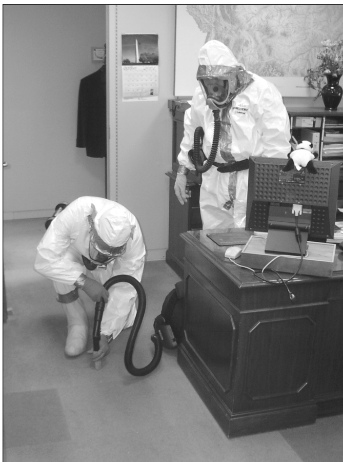
Figure 2: Cleanup Personnel Use a HEPA Vacuum in a Congressional Office