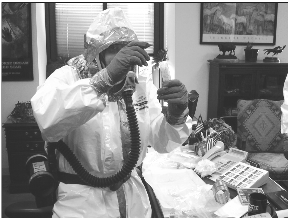
Figure 1: A Sample Is Inserted into a Vial in the Hart Senate Office Building