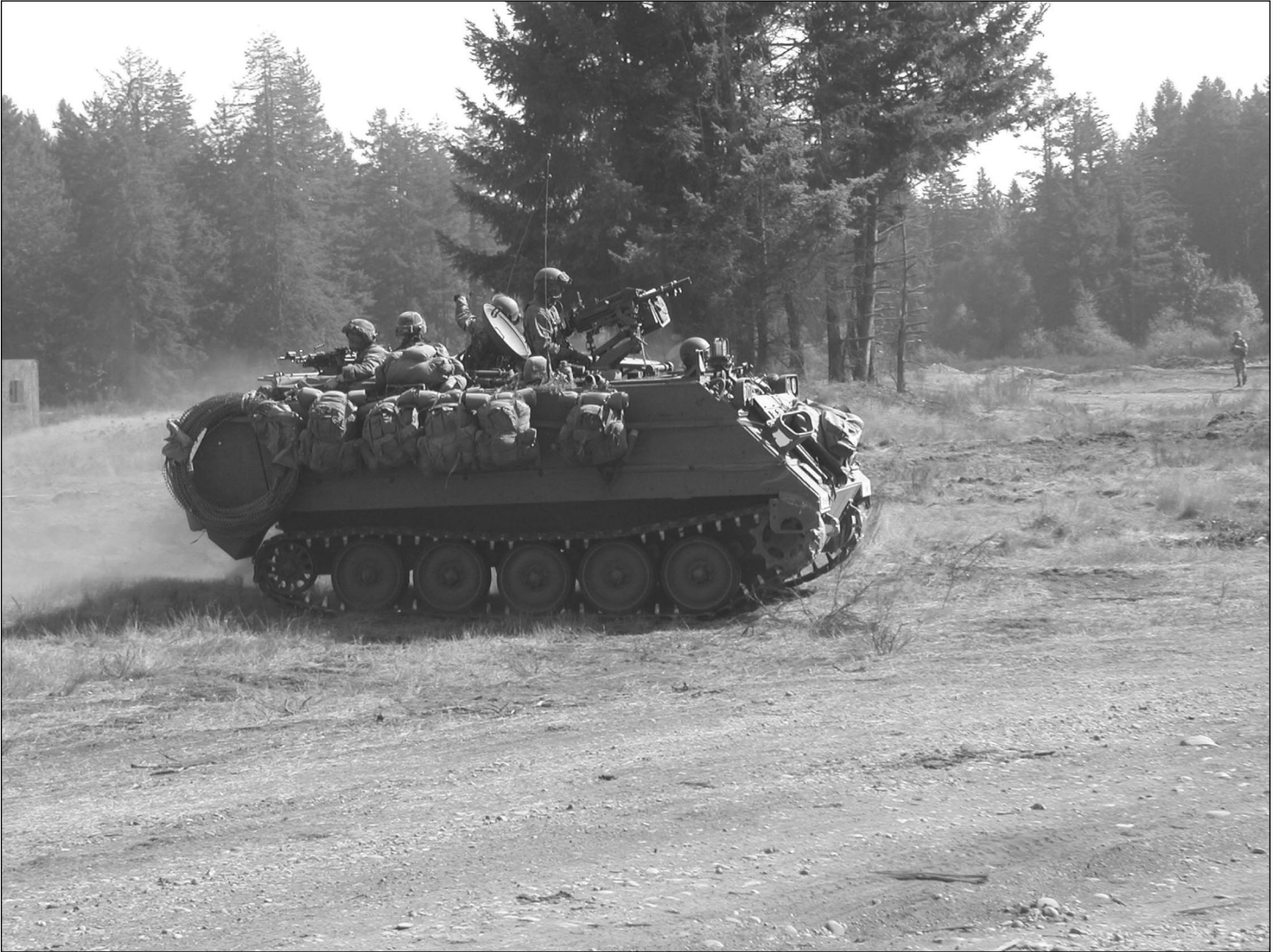
Figure 2: M-113A3 Armored Personnel Carrier