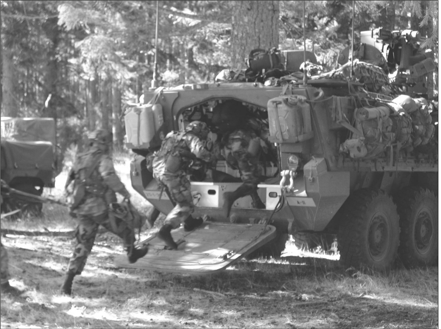
Figure 3: Stryker Infantry Carrier Ingress Excursion