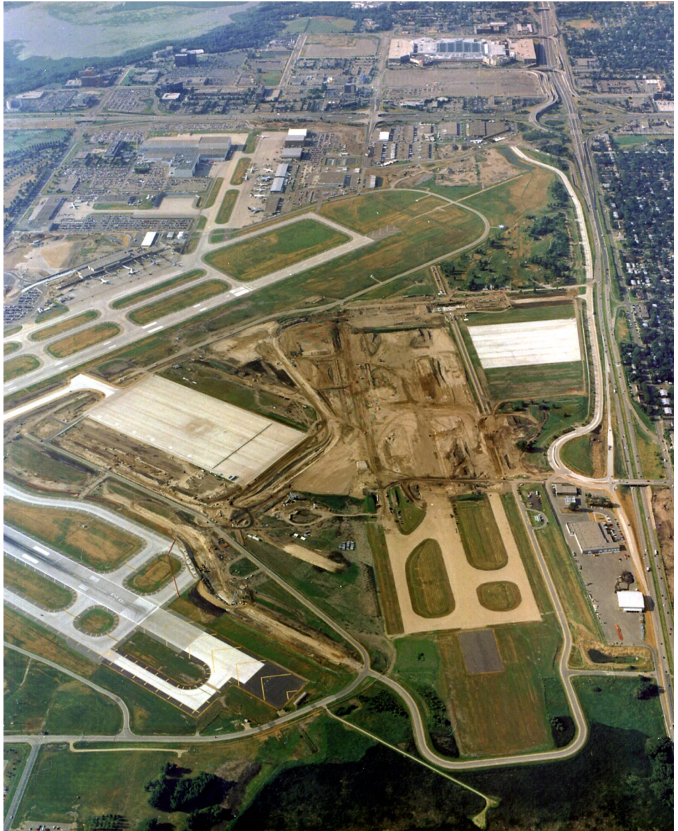
Figure 3: Increasing Airport Capacity through Runway Development