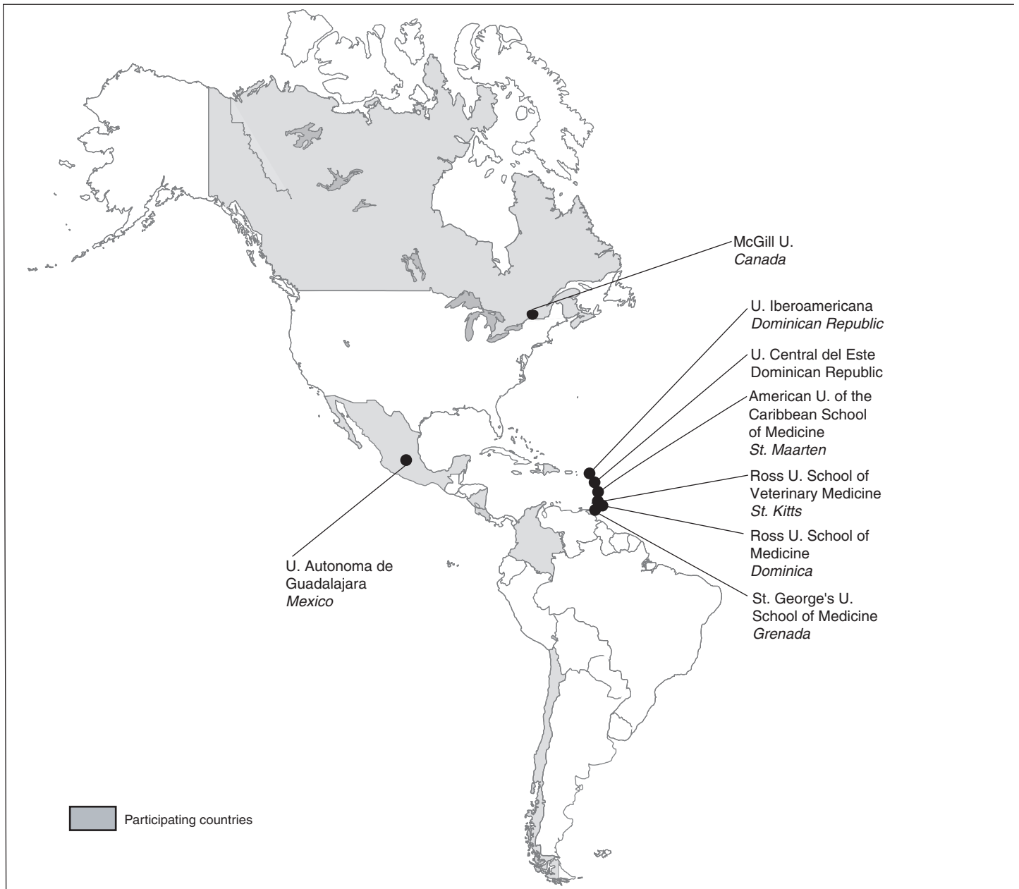
Figure 1: Countries with Schools Eligible to Participate in FFELP and Top 10 Foreign Schools by Loan Volume for Academic Year 2000-01