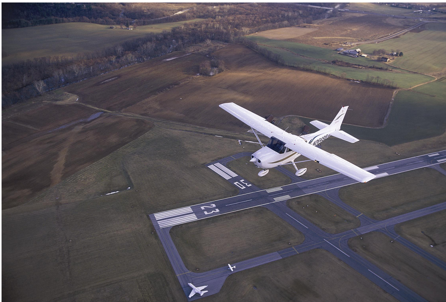
Figure 3: General Aviation Aircraft and Airport