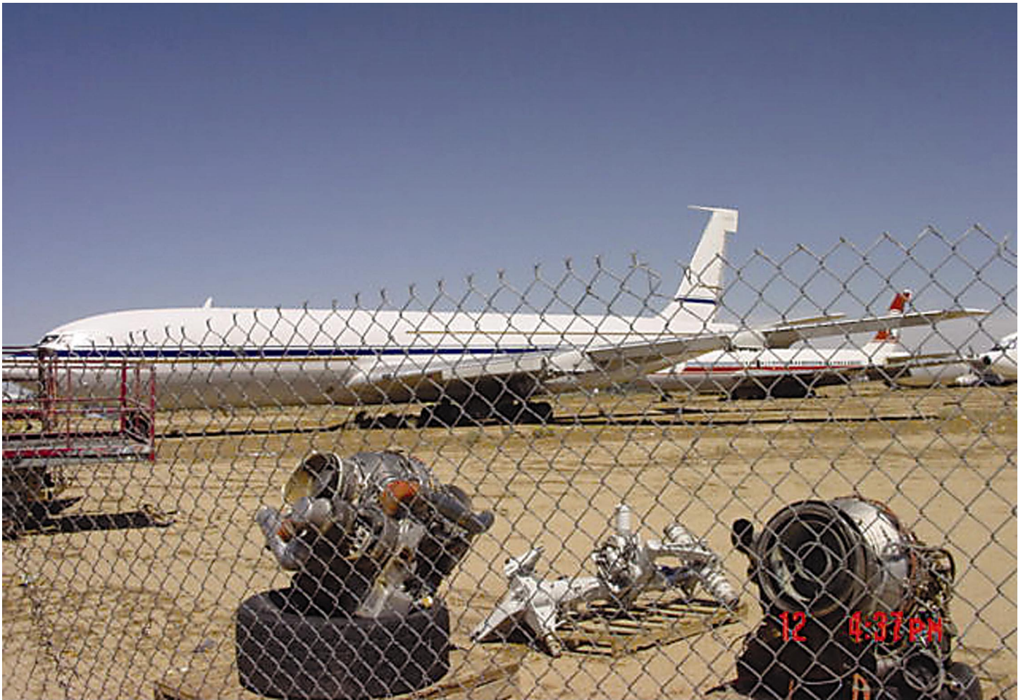
Figure 4: Airport Perimeter