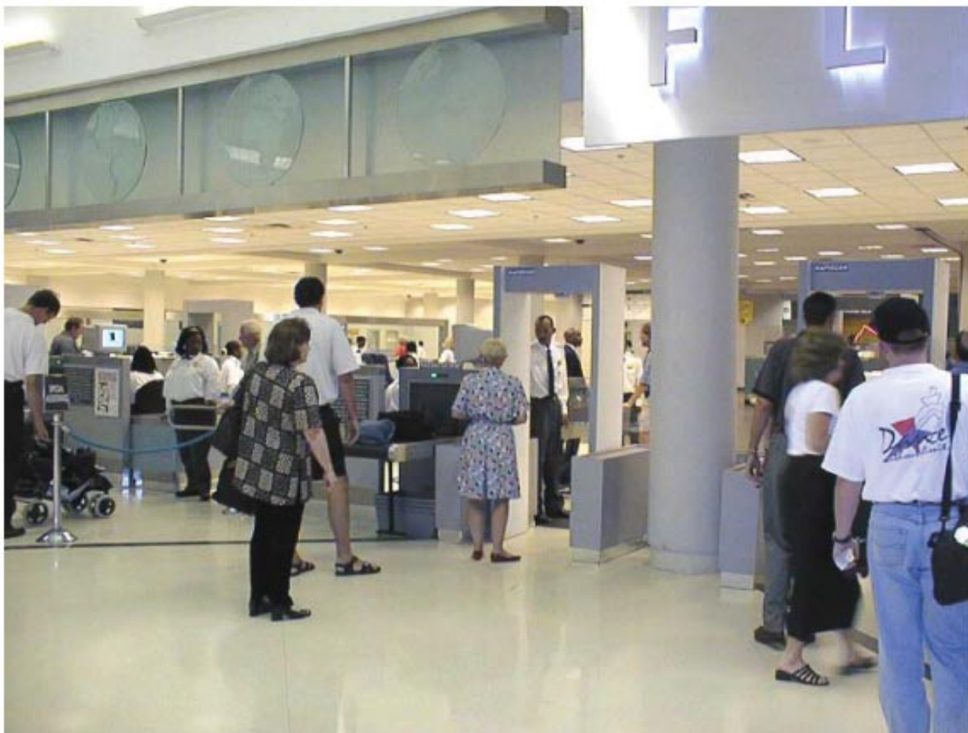
Figure 2: Screening Passengers at a U.S. Commercial Airport

In addition, according to FAA, U.S. and foreign airlines met the April 2003 deadline to harden cockpit doors on aircraft flying in the United States.