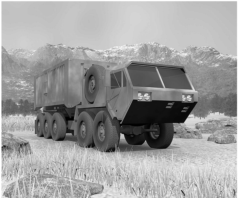
Figure 3: Crusader Wheeled Resupply Vehicle