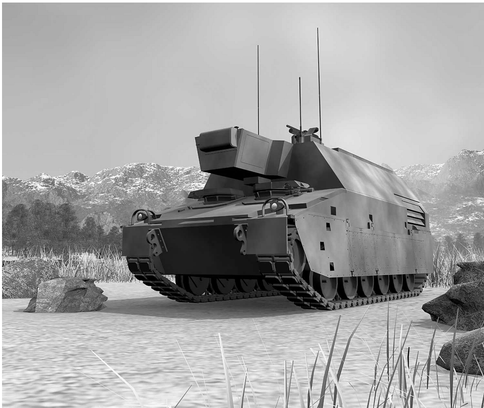
Figure 2: Crusader Tracked Resupply Vehicle