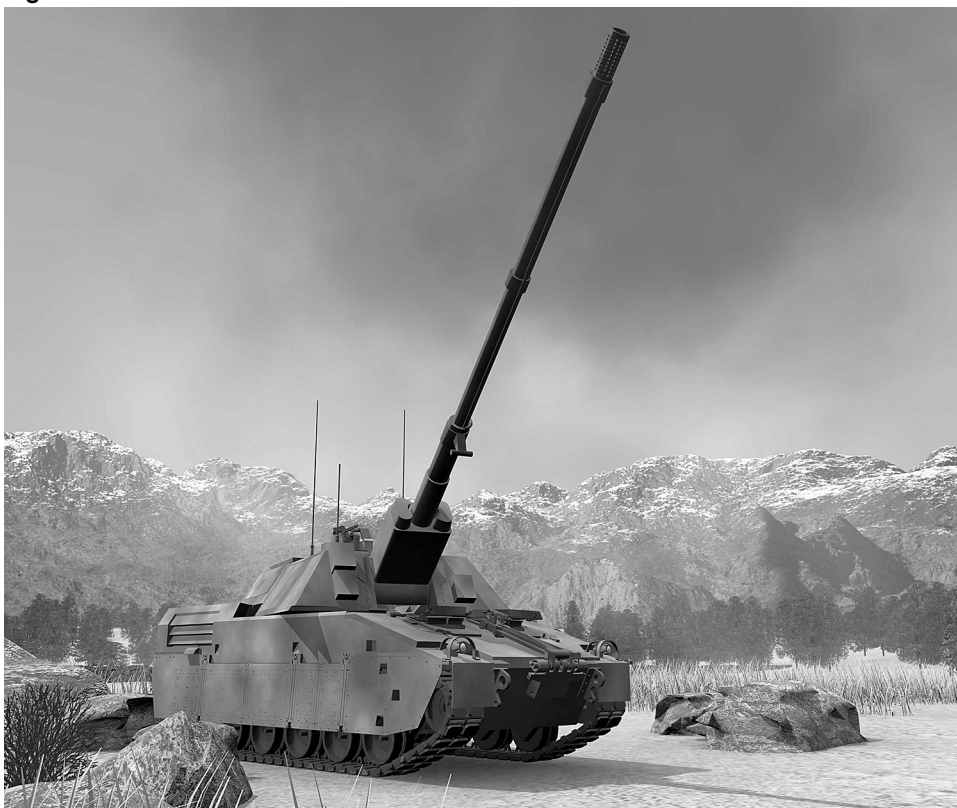
Figure 1: Crusader Howitzer