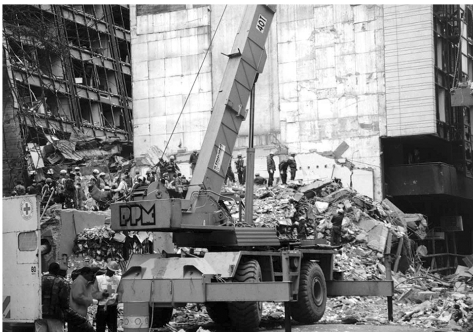
Figure 4: Response to al Qaeda Terrorist Attack, U.S. Embassy, Nairobi, Kenya, August 1998

The State Department is responsible for leading the U.S. response to terrorist incidents abroad. This includes measures to protect Americans, minimize incident damage, terminate terrorist attacks, and bring terrorists to trial. Once an attack has occurred, State's activities include measures to alleviate damage, protect public health, and provide emergency assistance. The Office of the Coordinator for Counterterrorism facilitates the planning and implementation of the U.S. government response to a terrorist incident overseas. In a given country, the ambassador would act as the on-scene coordinator for the response effort. (See figure 4.)