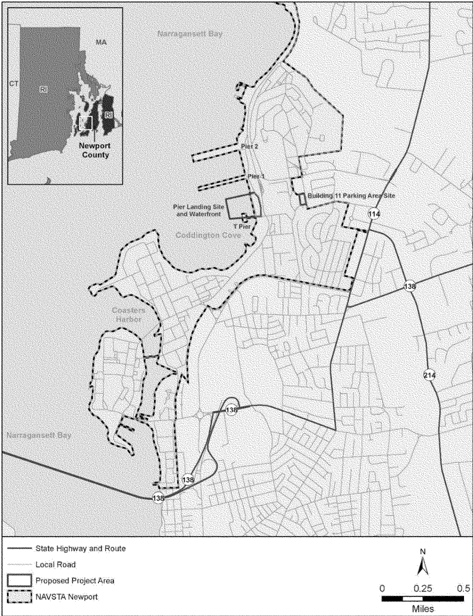
BILLING CODE 3510-22-C Figure 1. Proposed NAVSTA Project Area

The proposed activity would establish adequate pier, shore side, and support