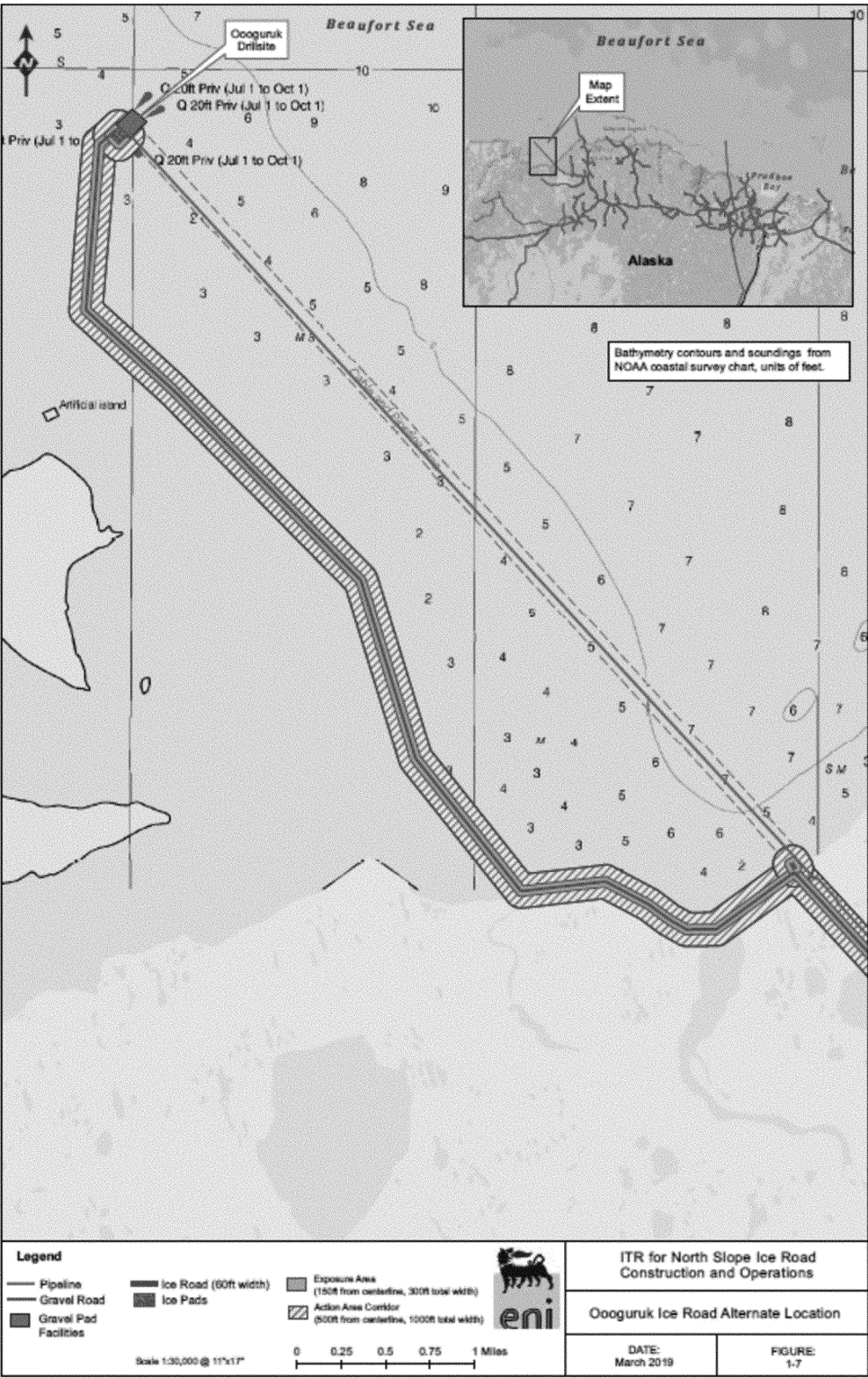
Figure 4. Oooguruk Ice Road Alternate Location