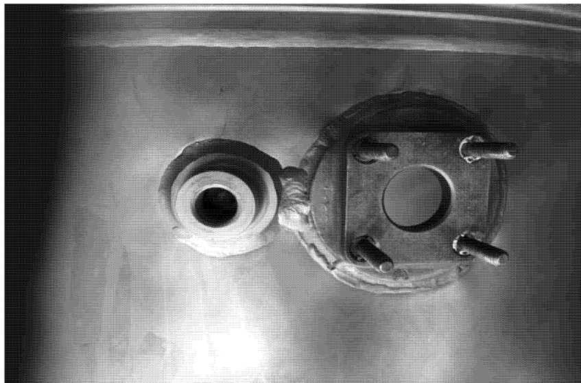
Figure 2 to Paragraph (h) of this AD. Combustion Chamber Case Assembly with One-Piece Bleed Pad with P3 Boss