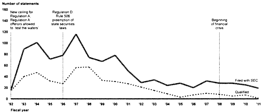
Data from GAO Study: Regulation A offerings filed and qualified, 1992-2011

qualified Regulation A offerings in fiscal years 1992 to 2011. 541 Specifically, the GAO notes that the number of filed Regulation A offerings decreased from 116 in 1997 to 19 in 2011. The number of qualified offerings dropped from 57 in 1998 to 1 in fiscal year 2011.