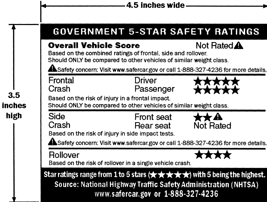
Figure 2 to § 575.302