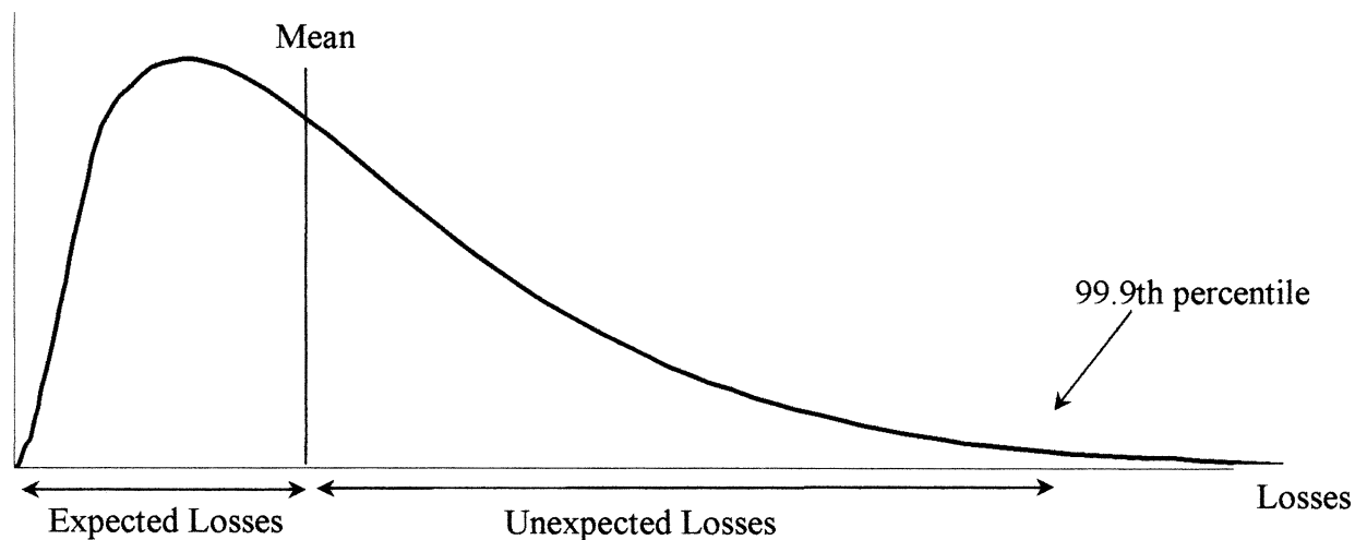
Figure 1 – Probability Distribution of Potential Losses

The area under the curve to the right of a particular loss amount is the probability of experiencing losses exceeding this amount within a given time horizon. The figure also shows the statistical mean of the loss distribution, which is equivalent to the amount of loss that is "expected" over the time horizon. The concept of "expected loss" (EL) is distinguished from that of "unexpected loss" (UL), which represents potential losses over and above the EL amount. A given level of UL can be defined by reference to a particular percentile threshold of the probability distribution. For example, in