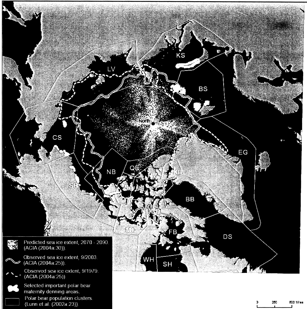
Figure 2. Selected Polar Bear Terrestrial Denning Areas Compared to Past, Present, and Predicted Future Summer Sea-Ice Extent

Polar Bear Population Abbreviations. CS = Chukchi Sea; SB = Southern Beaufort Sea; NB = Northern Beaufort Sea; QE = Queen Elizabeth Islands; VM = Viscount Melville Sound; NW = Norwegian Bay; LS = Lancaster Sound; MC = M'Clintock Channel; GB = Gulf of Boothia; FB = Foxy Basin; WH = Western Hudson Bay; SH = Southern Hudson Bay; KB = Kane Basin; BB = Baffin Bay; DS = Davis Strait; EG = East Greenland; BS = Barents Sea; KS = Kara Sea; LV = Laptev Sea; Arctic Basin is the unlabelled area centered on the North Pole