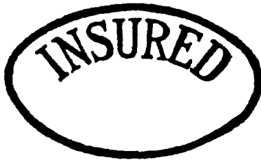
Exhibit 2.3 Insurance Endorsements, Form 3813-P