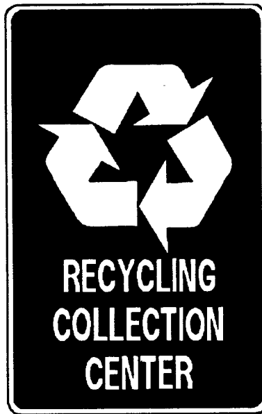
COLORS RETROREFLECTIVE WHITE LEGEND AND BORDER ON RETROREFLECTIVE GREEN BACKGROUND